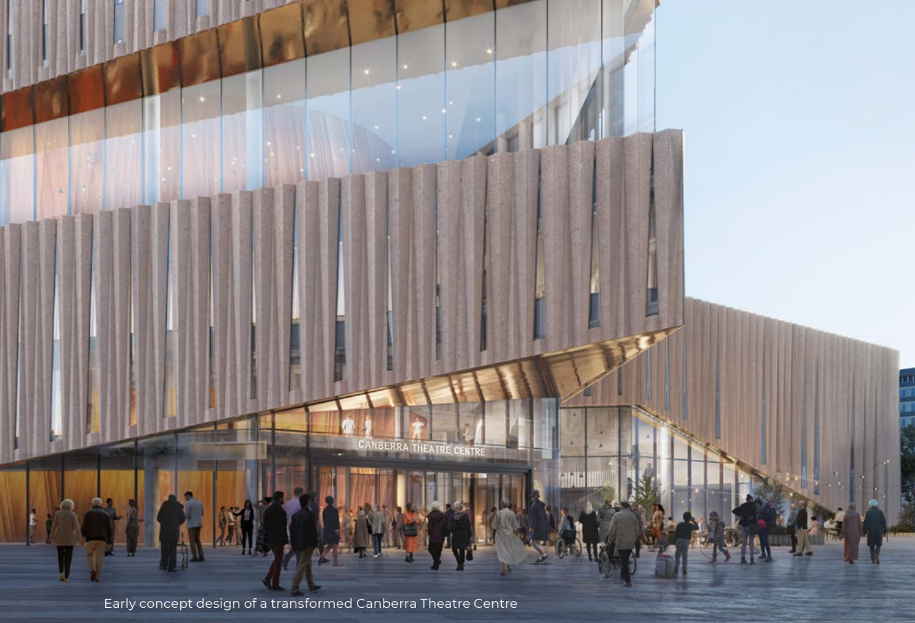
Early concept design of a transformed Canberra Theatre Centre