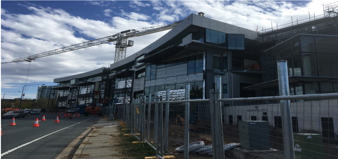
ACT Law Courts Facilities