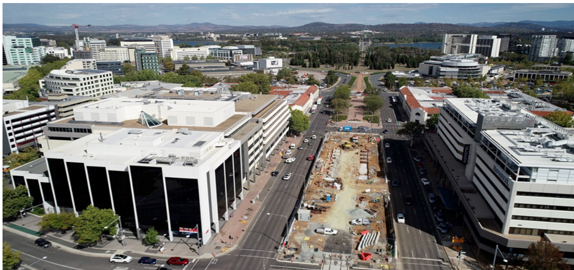
Light Rail – Stage 1–Alinga Street median construction works looking south