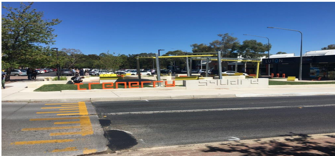
Weston Trenerry Square