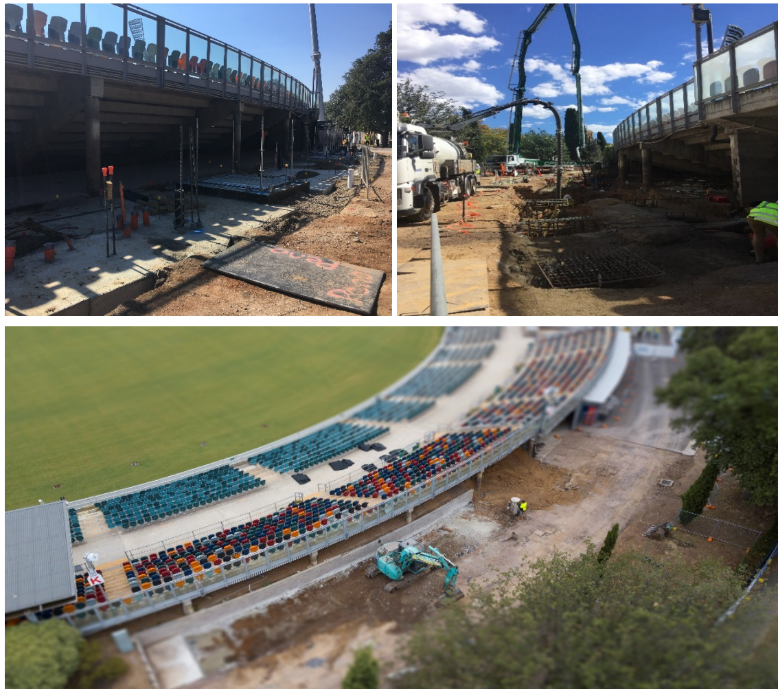
Manuka Oval Improvements