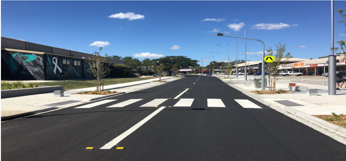
Gartside Street - Erindale Group Centre