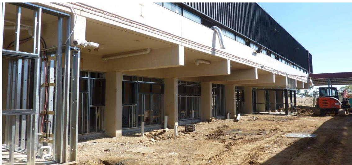
Work on modernising Belconnen High School