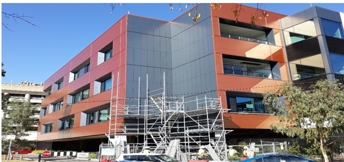
Centenary Hospital for Women and Children - Composite panel replacement