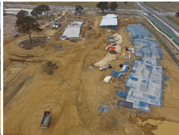
North Gungahlin school infrastructure