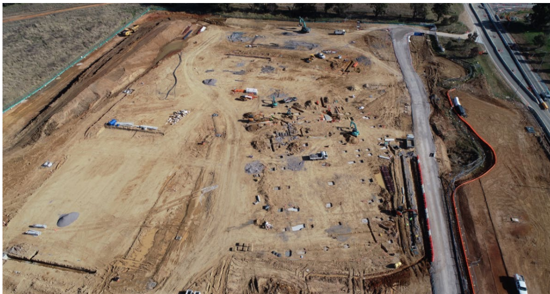
East Gungahlin High School - Inground Services Underway, Building Pads and Building Footings Underway