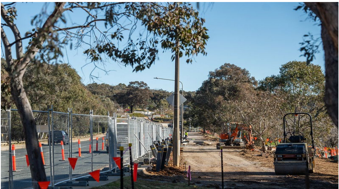
Active travel - Belconnen Bikeway Stage 2