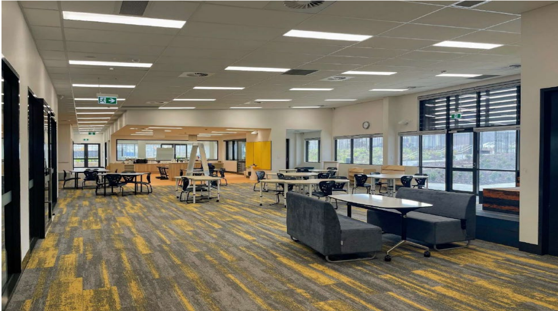
Throsby Primary School Collaborative Space