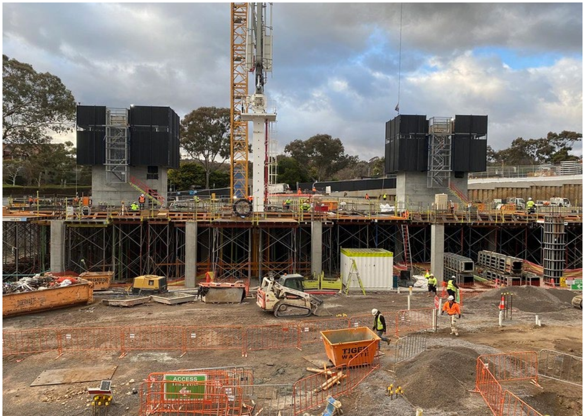
Canberra Hospital Expansion Project