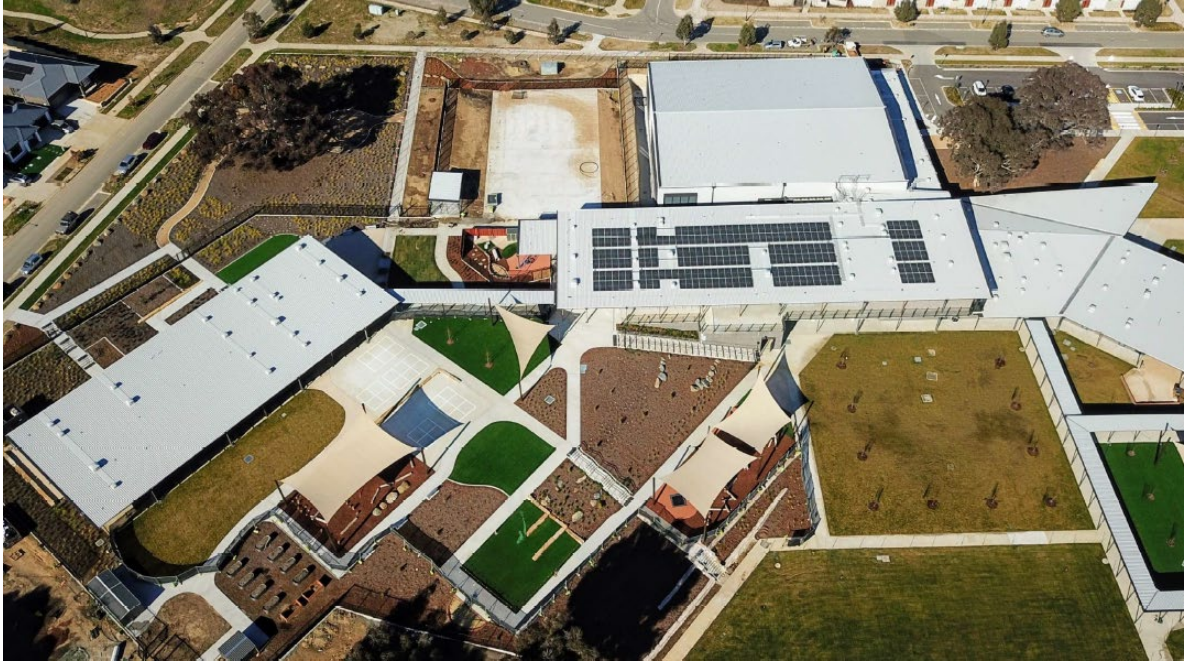
Throsby Primary School - Years 5-6 Building, Year 3-4 Building, Library, Multipurpose Hall and Administration

The Capital Works Program also includes investment in Information and Communication Technology (ICT) and Plant and Equipment (P&E).