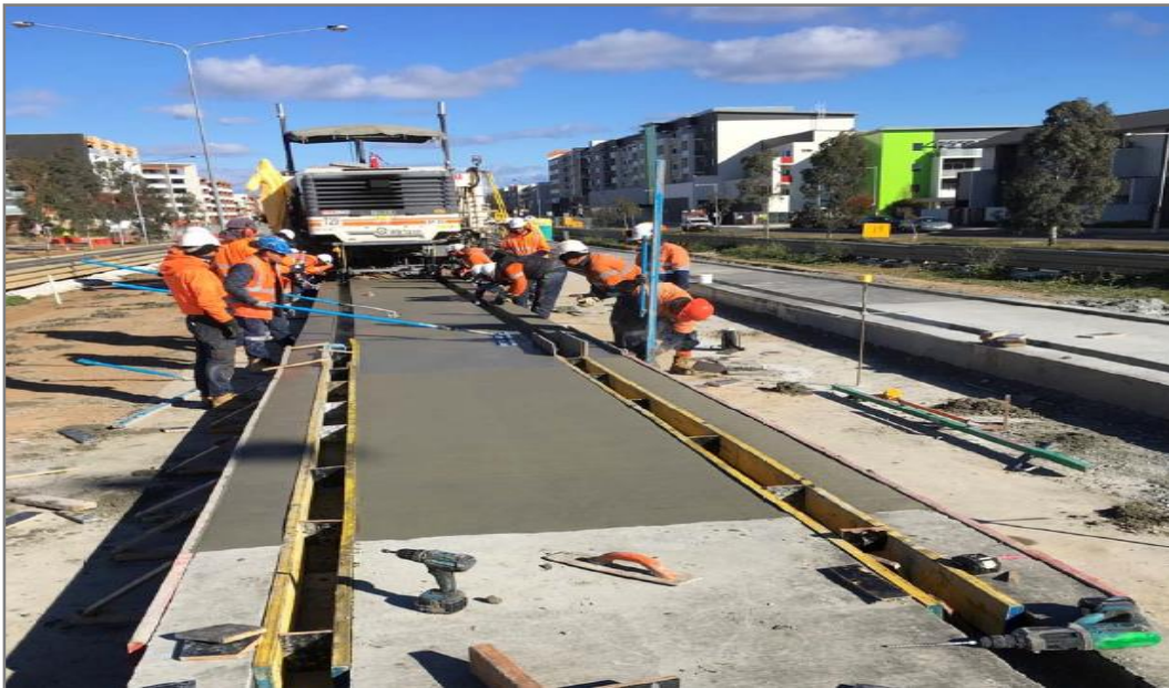
Light Rail - Stage 1 - Flemington Road: Slip form paver (machine) and track slab construction.