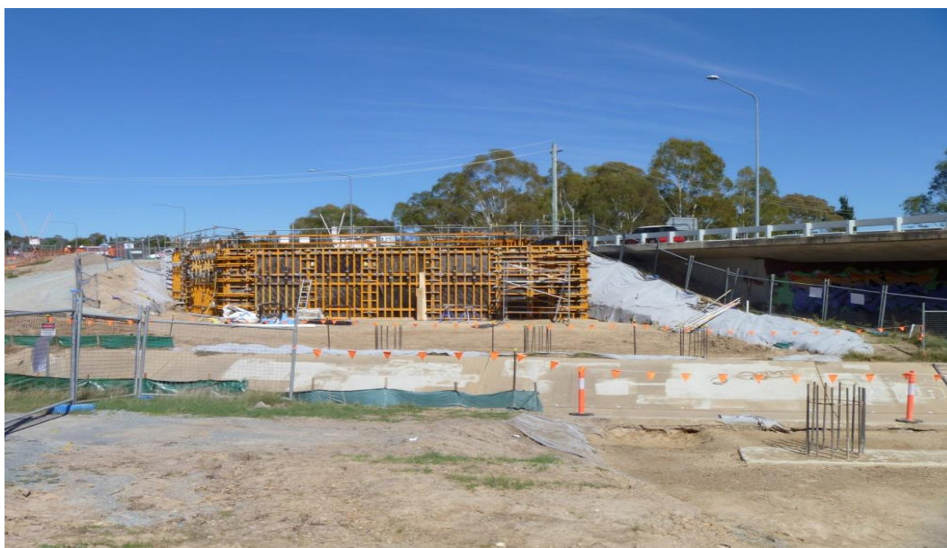
Ashley Drive duplication