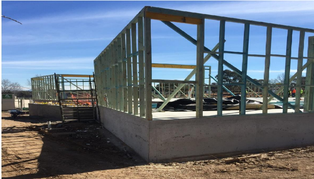
Caroline Chisholm School