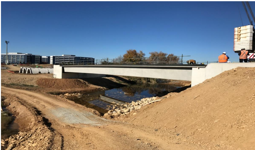
Woolshed Creek Bridge - Majura Link Road