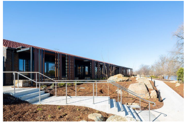
Figure 7: Clare Holland House Project