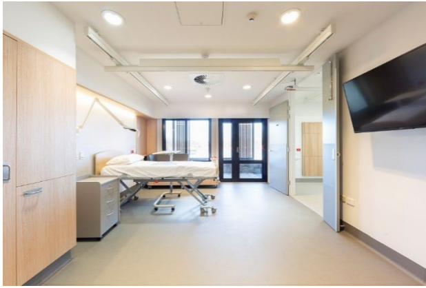
Figure 8: Clare Holland House Project - Interior