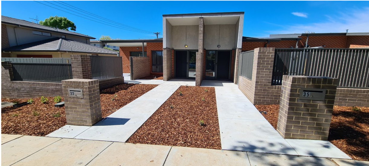
Figure 5: Completed new public housing property in the Inner South