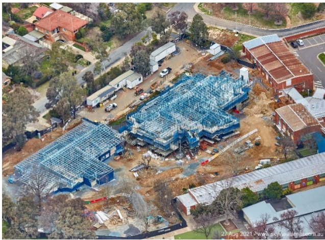
Figure 4: Campbell Public School Upgrade