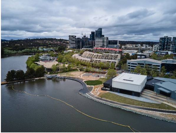
Figure 3: Lake Ginninderra improvements