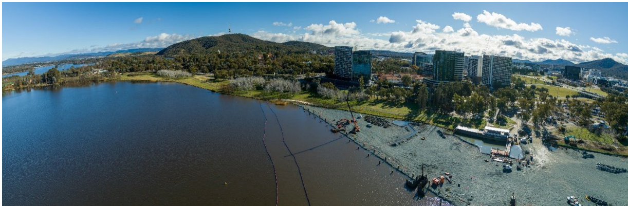
Figure 6: Acton Waterfront Stage 2