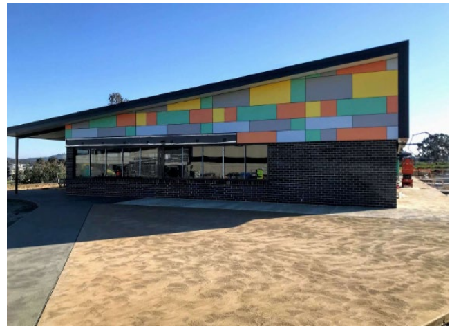
Figure 3: Throsby (P-6)