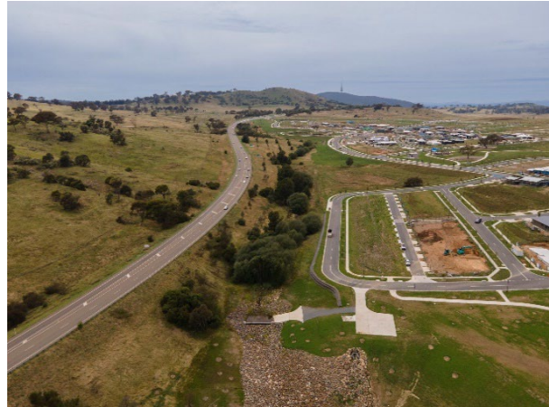
Figure 4: William Hovell Drive Duplication