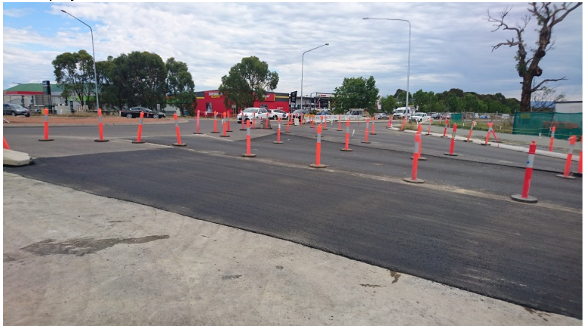
Gundaroo Drive duplication – Stage 1