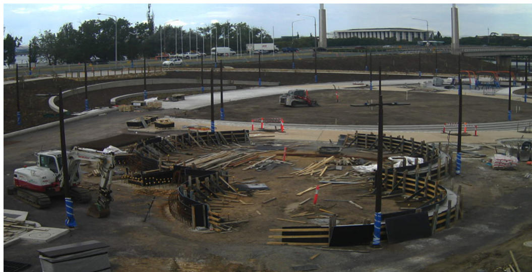
West Basin Infrastructure Project