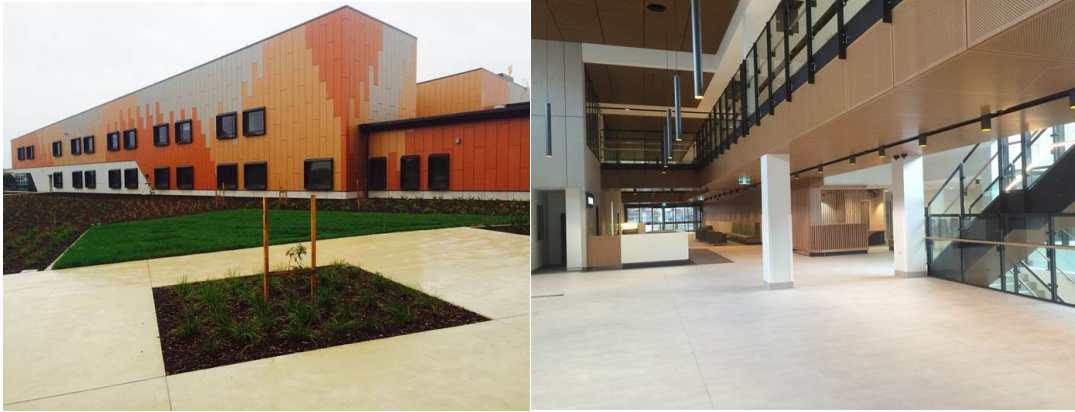
University of Canberra Public Hospital