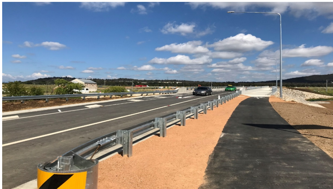
Majura Link Road construction.