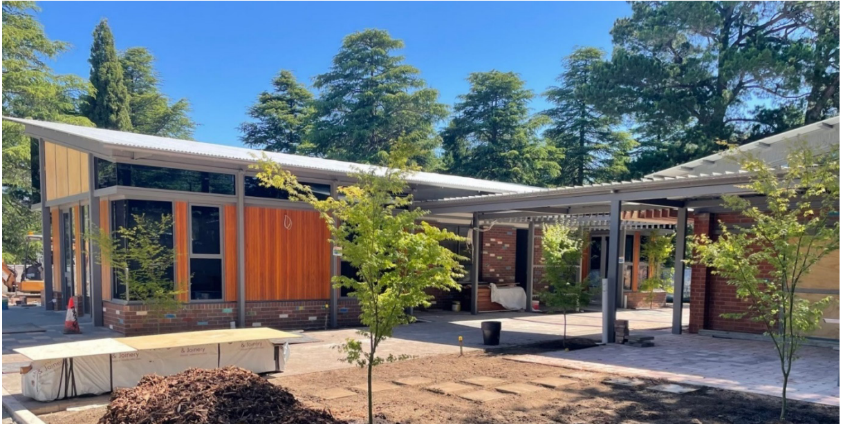
Haig Park Community Centre

The Capital Works Program also includes investment in Information and Communication Technologies (ICT) and Plant and Equipment (P&E).