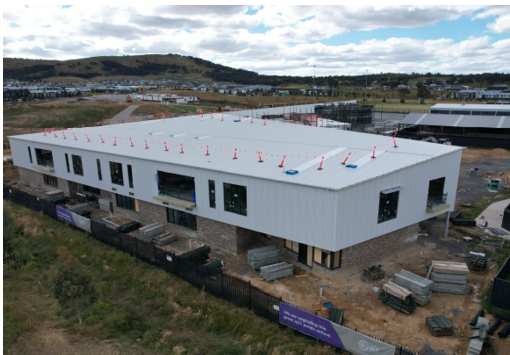
Margaret Hendry School Expansion