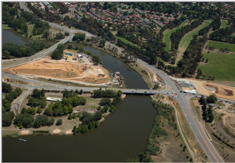
Aerial of Majura Parkway (Bridge 1)