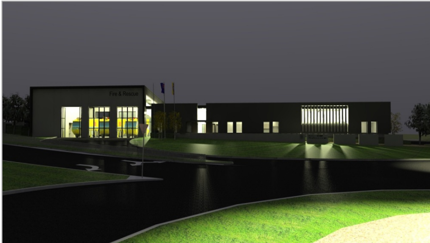
Artist's impression for the ESA Station Upgrade and Relocation – South Tuggeranong Station