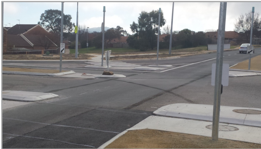
Intersection upgrade at McBryde Crescent and Ashley Drive

Richardson and Sternberg Crescent in Wanniasa, and works undertaken on this project are expected to improve traffic congestion during peak periods.