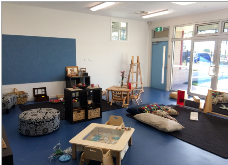
Completed classroom at the Holder Early Childhood Centre