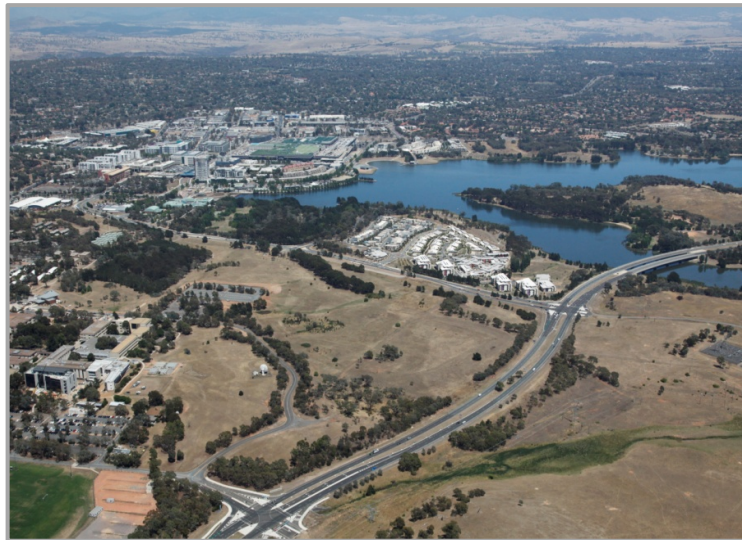
Proposed site for the University of Canberra Public Hospital