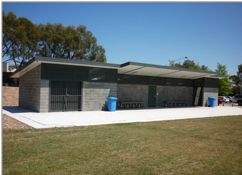
Toilet block upgrades at the recently completed Bonython Sportsground.