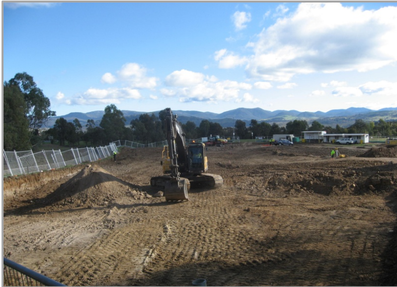
Earthworks at ESA Station Upgrade and Relocation – South Tuggeranong Station