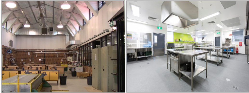
Left: Metal Workshop upgrade at Lake Tuggeranong College Right: Hospitality Services upgrade at Erindale College