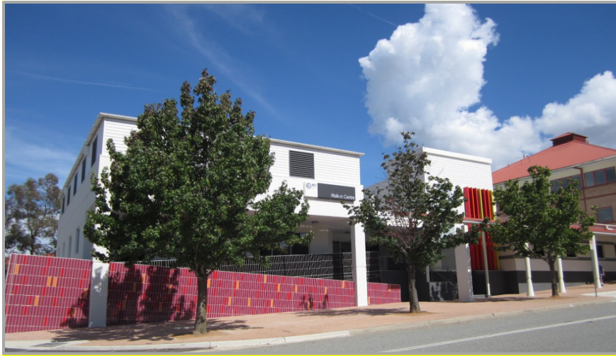
Exterior of the Tuggeranong Walk-in-Centre