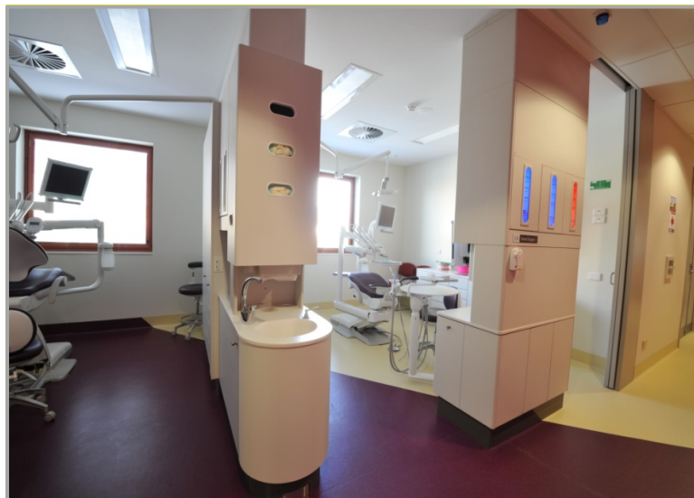
Facilities at the Tuggeranong Health Centre