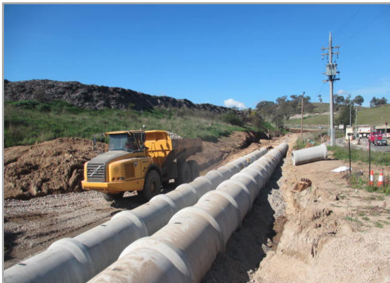
Stormwater works for Mugga Lane – Land Fill Extension – Stage 5