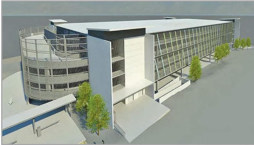
Artist Impression of the Calvary Car Park