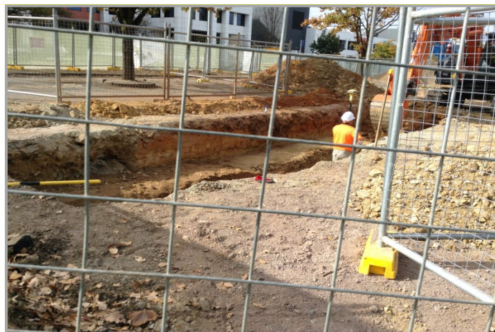
Construction underway along Constitution Avenue