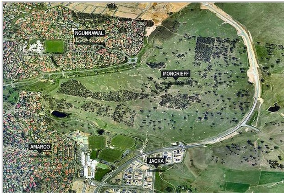
Land Release in Moncrieff

There are a number of related infrastructure projects underway in the Territory which will facilitate the release of land to the community, including the Horse Park Drive Pond, Cravens Creek Pond, North-South Arterial Road for Molonglo Suburbs (John Gorton Drive), Molonglo 2 – Uriarra Road Upgrades, Horse Park Drive Extension from Burrumarra Avenue to Mirrabei Drive and Molonglo 2 – Sewer and Pedestrian Bridge over the Molonglo River.