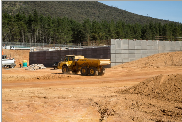
Construction on Transport for Canberra – Majura Parkway