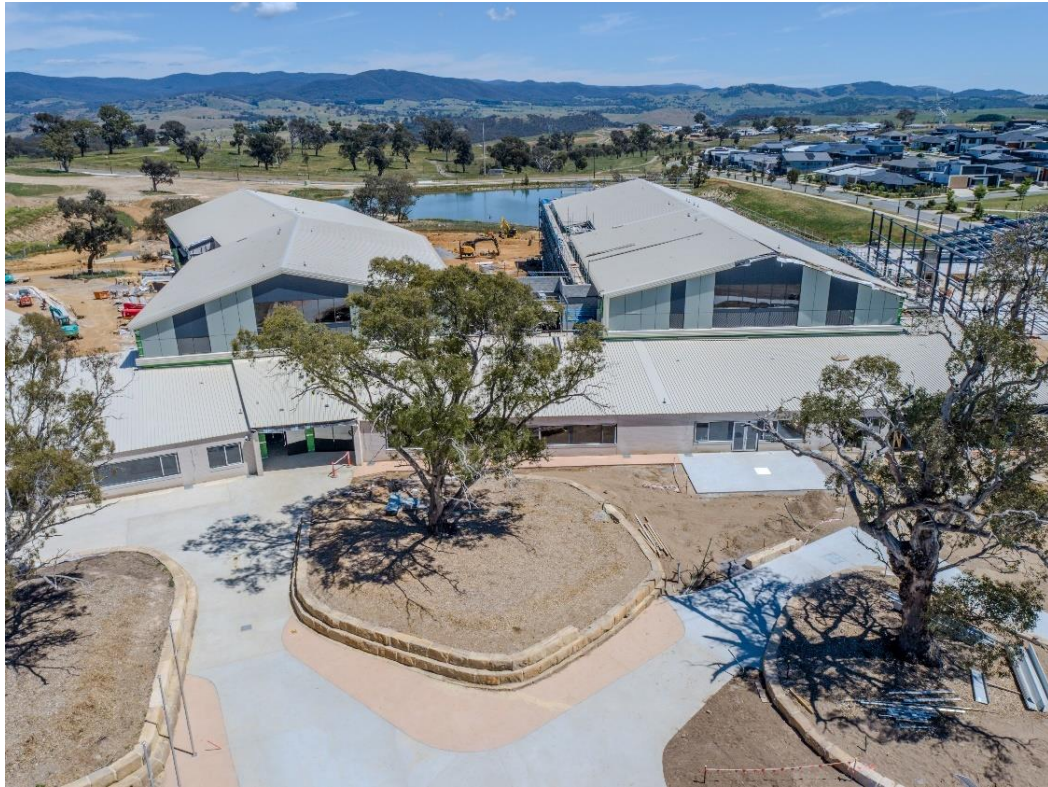
Strathnairn Primary School