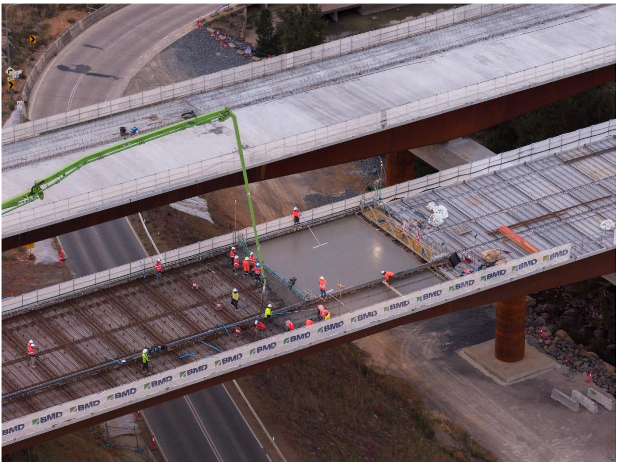
Molonglo River Bridge – Concrete pour

William Hovell Drive Duplication – Both environmental and planning approvals have been received including the Offset Management Plan and the Construction Environmental Management Plan. Construction is scheduled to commence in May 2026.