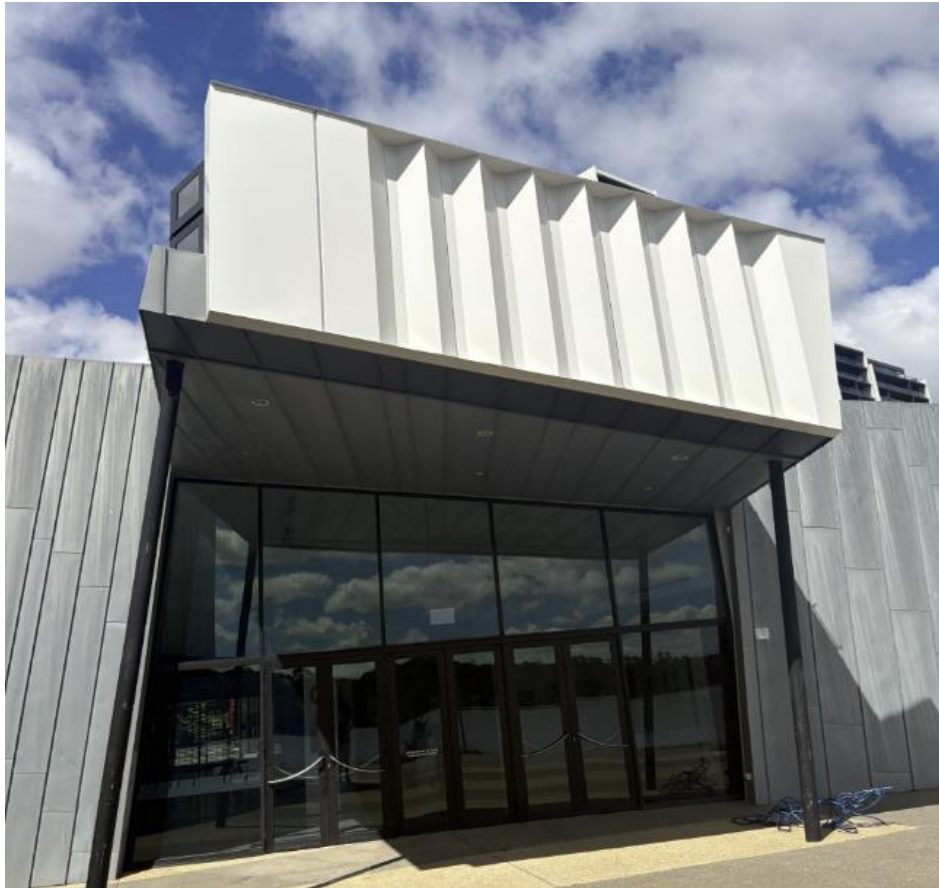
Recently completed Belconnen Arts Centre