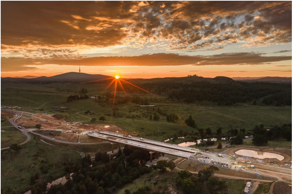
Molonglo River Bridge

The Capital Works Program also includes capital investment in Information and Communication Technology (ICT) and Plant and Equipment (P&E).