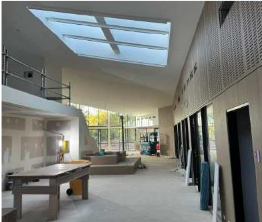
Watson Health Hub - Palm Hub

Improvements at the Ngunnawal Bush Healing Farm – Installation of a new machinery shed for the storage of farm vehicles and infrastructure is underway and is scheduled to be completed by June 2026.