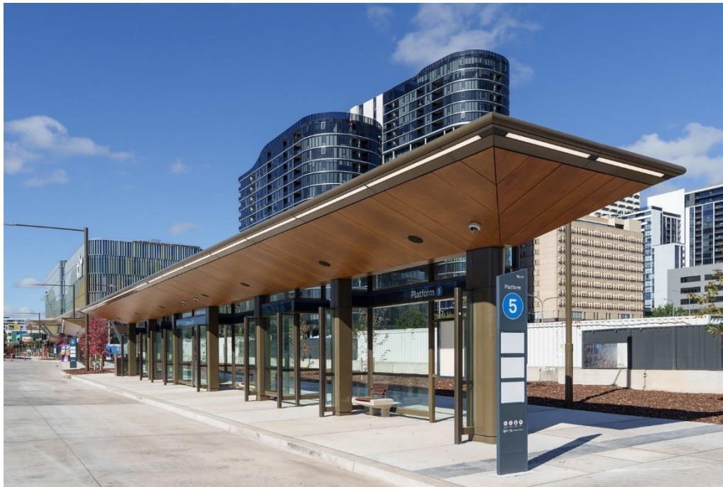
CIT Woden Transport Interchange