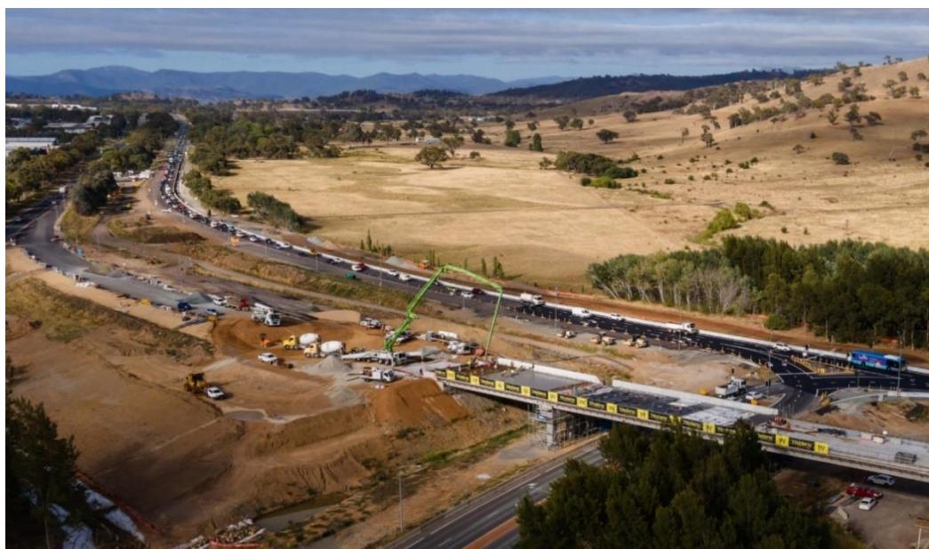
Monaro Highway Upgrades

Canberra Institute of Technology (CIT) Campus Woden Project – Public Transport Interchange – The new transport interchange has been completed.