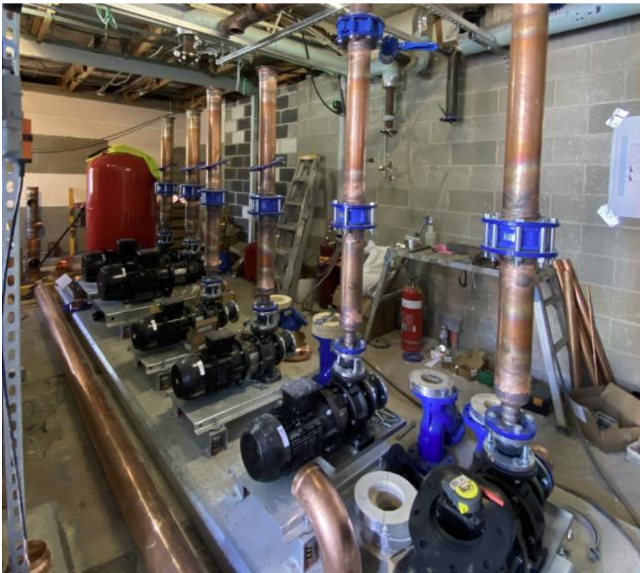
New pumps and pipework at Weetangera Primary School

Delivering the New Recycling Facility (MRF) and Food Organics Facility (FOGO) – Project progress includes: