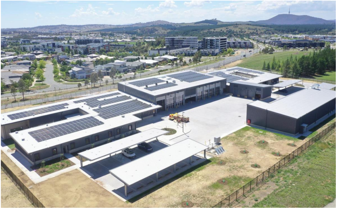
Recently Completed Molonglo Emergency Services Station