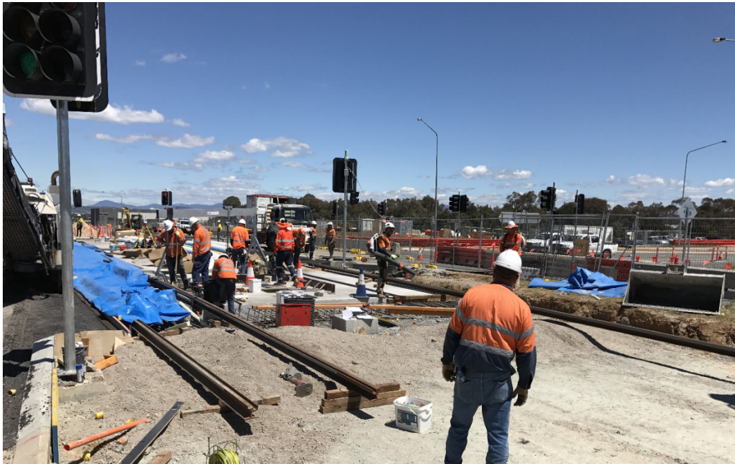
Light Rail - Stage 1 - track slab and physical track construction.