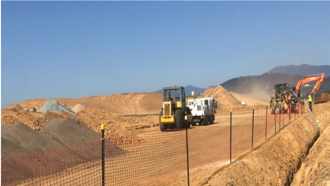
John Gorton Drive Extension