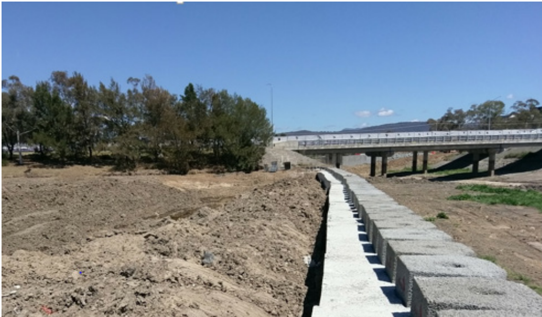
Isabella Weir upgrade and Isabella Wetland