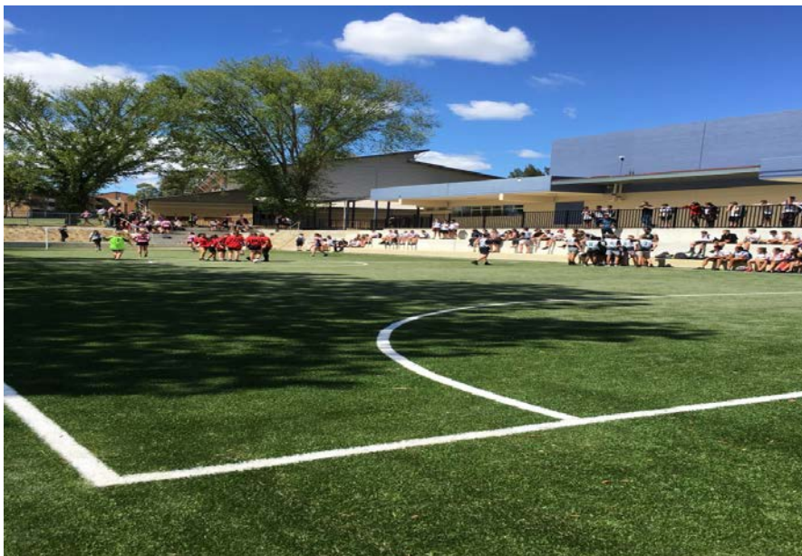
External learning and play space at Belconnen High School