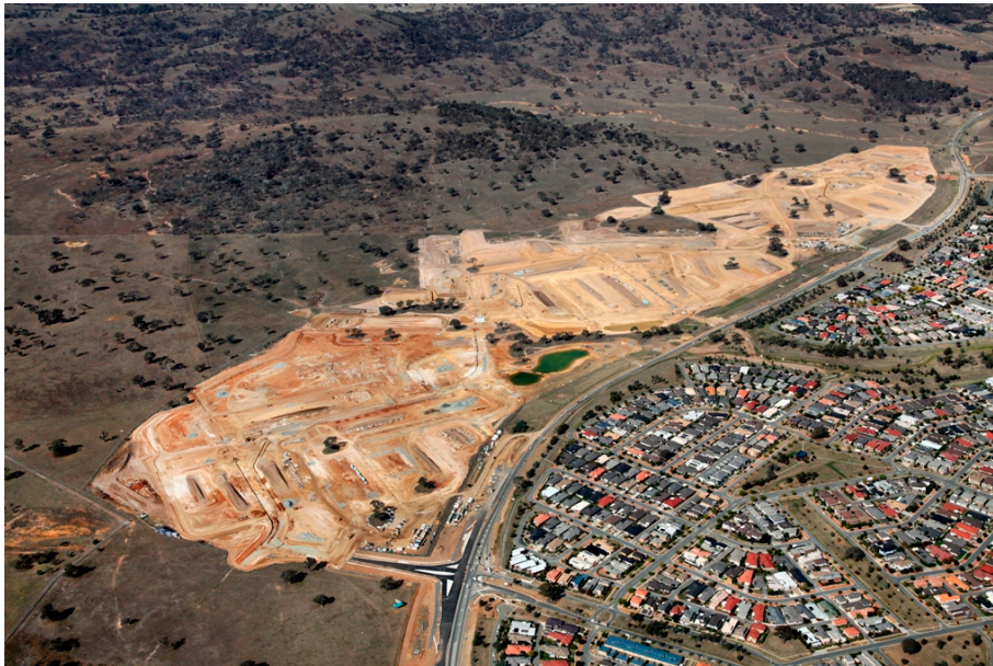
The new suburb of Throsby