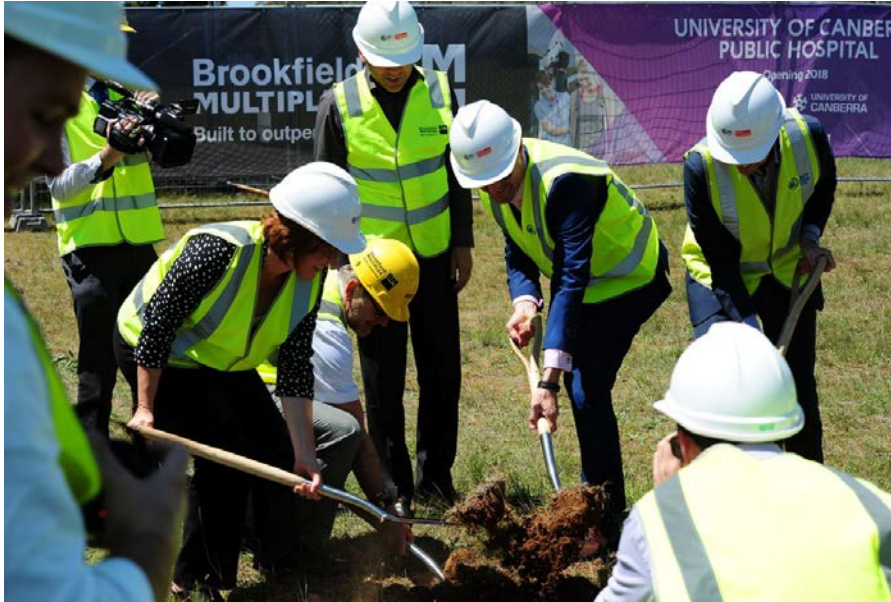
University of Canberra Public Hospital – Sod Turning