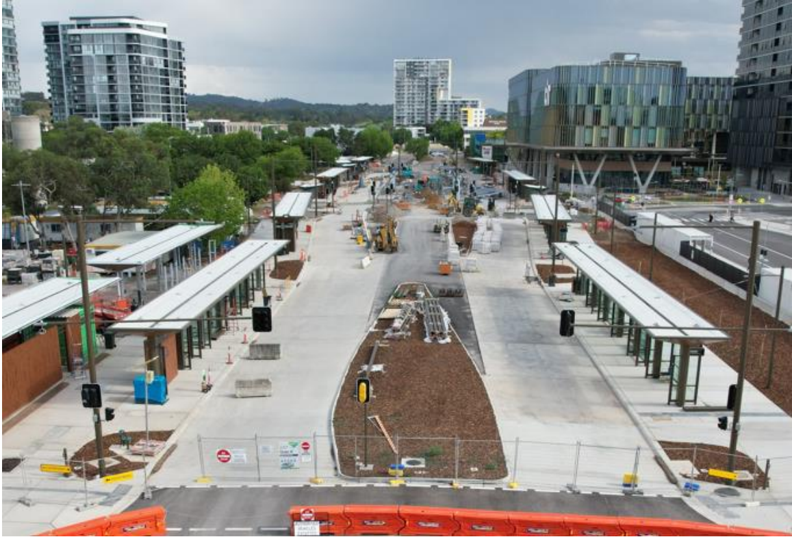
CIT Woden Transport Interchange