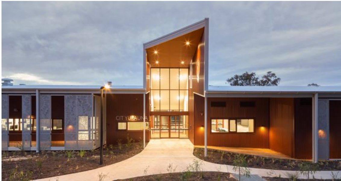
CIT Yurauna Building Entrance

Narrabundah College Modernisation – Construction is underway with windows installed and roof works completed.