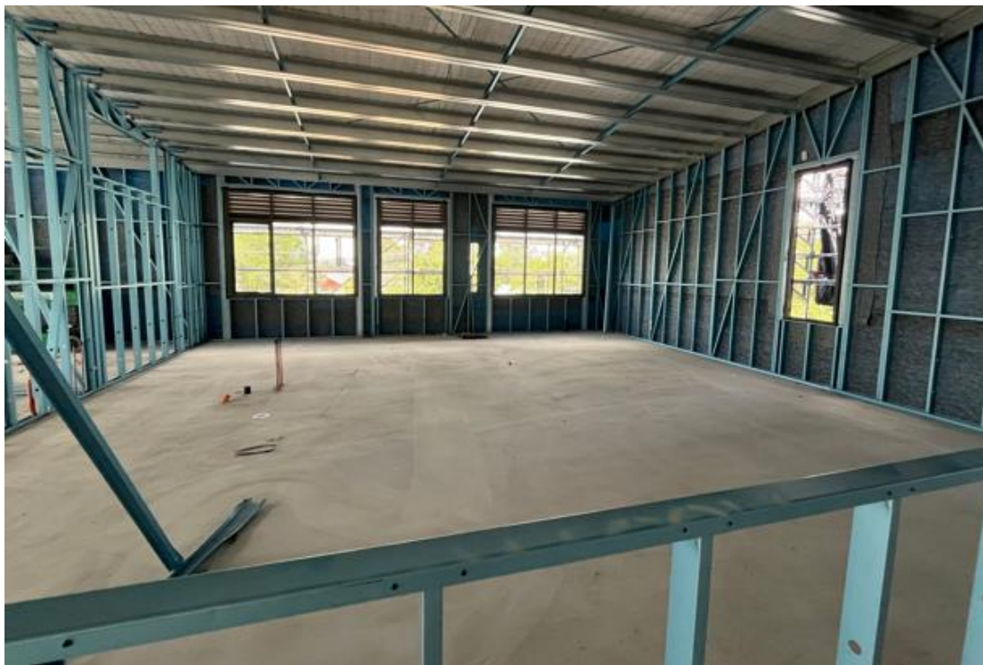
Narrabundah College Level 1

Narrabundah College Modernisation – Construction is underway with windows installed and roof works completed.