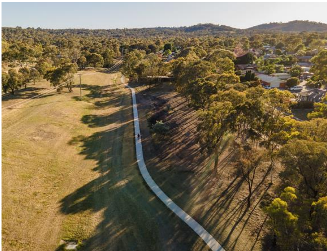
Athllon Drive – New footpath