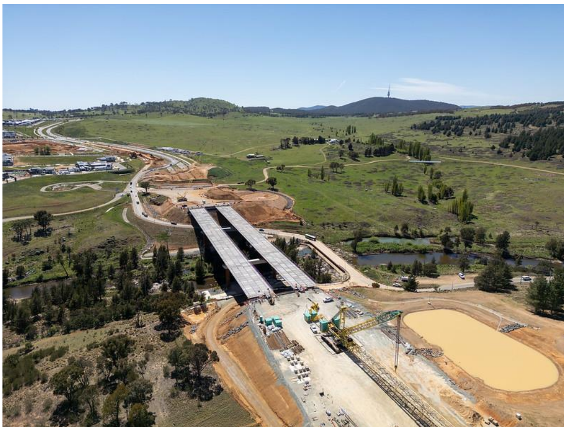
Molonglo River Bridge

The Capital Works Program also includes capital investment in Information and Communication Technology (ICT) and Plant and Equipment (P&E).