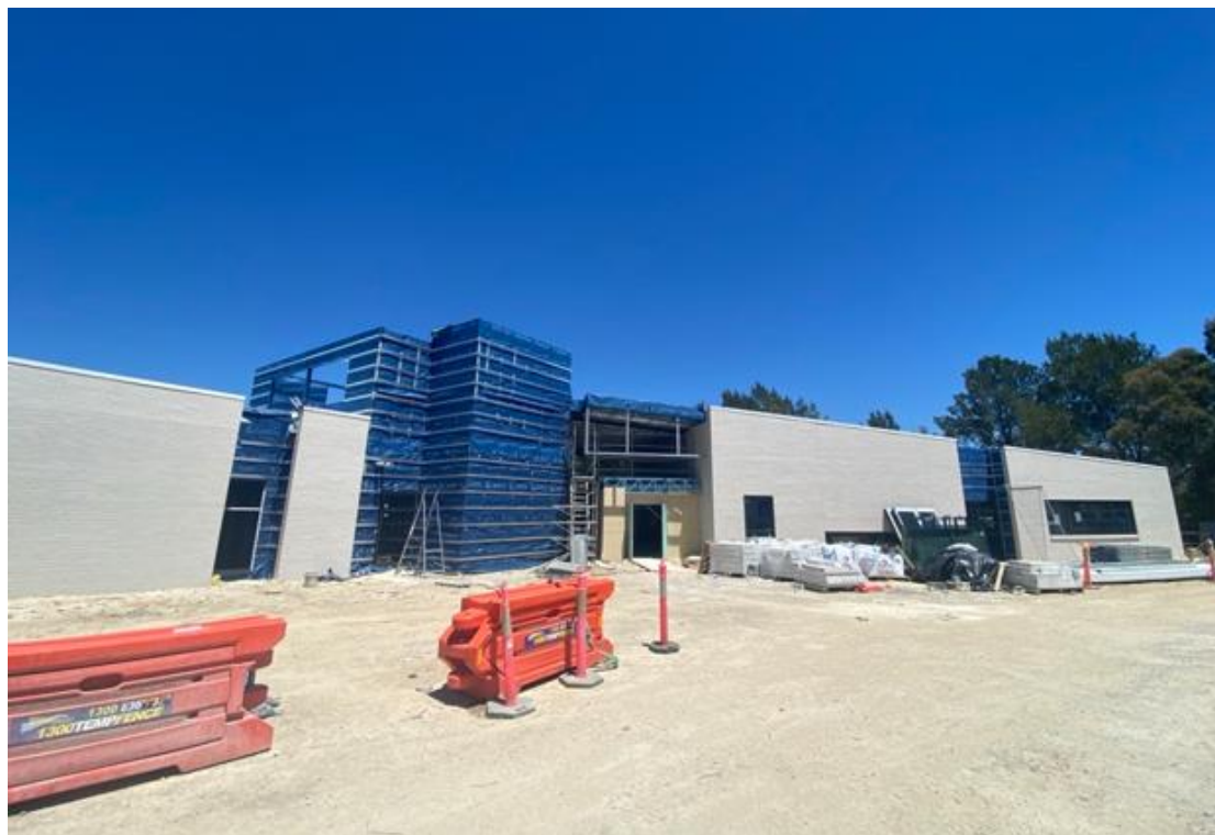
Conder Health Centre Construction

Expanding community-based health services – Construction of the South Tuggeranong (Conder) Health Centre is progressing well with brickwork, windows and glazing 90 per cent complete. Electrical, cable tray and mechanical services are underway and the building has been roofed.