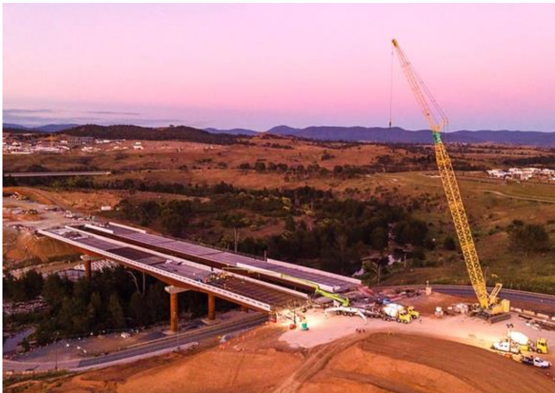
Molonglo River Bridge – Concrete pour at the northern end