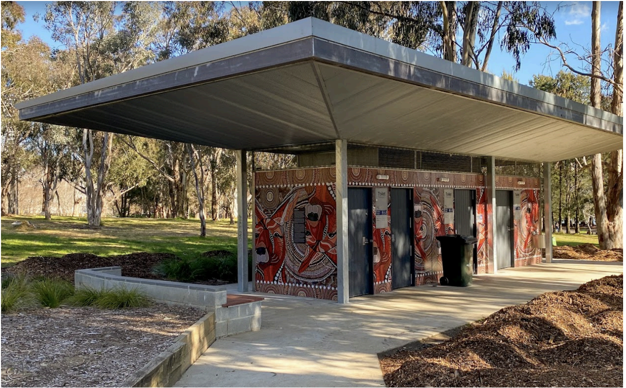
John Knight Memorial Park, Belconnen