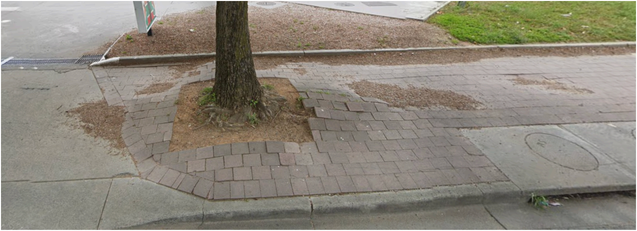
uneven footpaths along Cooyong Street, Braddon

Cooyong Street currently presents a visually unattractive and unwelcoming urban environment to residents and visitors that is not fitting for our national capital city. The unattractive vista presented when looking from Braddon to Civic in this area is not fitting for the CBD.