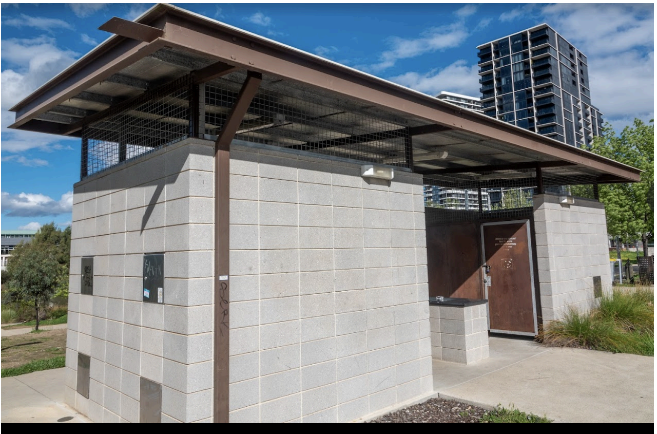
Skate Park, Belconnen

We would like to draw attention to the Federal grant Changing Places which provides funding for accessible toilet facilities for people with disabilities. The provision of