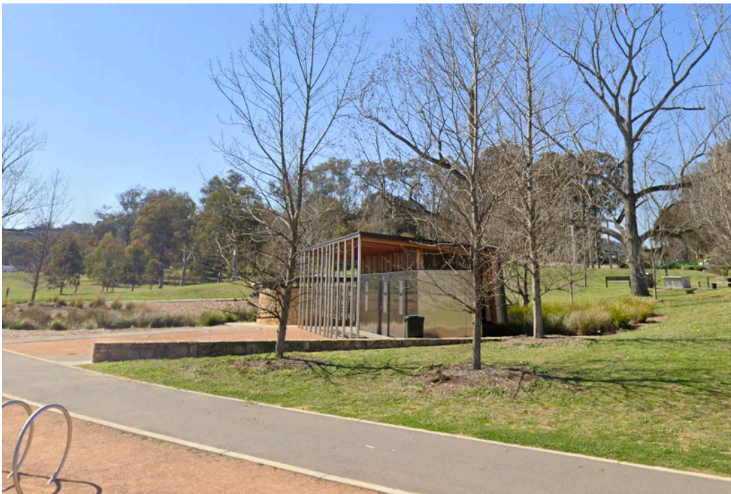
Kings Park, near the Carillion

We consider the lack of toilets in the park to be a major issue for Braddon and we propose a toilet block with multiple stalls, similar to the one near the Carillion in Kings Park, or facilities in parks in Belconnen.