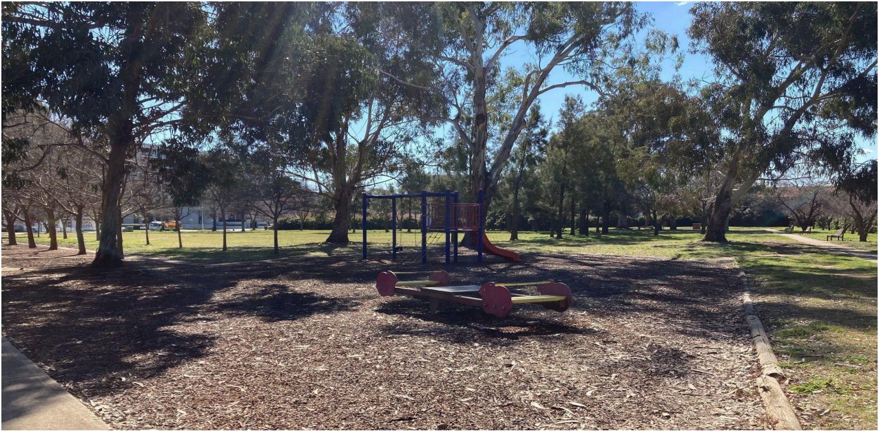
Playground in Lowanna Street Park, Braddon

In late 2021 a community survey focused on the Lowanna Street park was run by the founders of an online group, Friends of Braddon Parks. 100% of respondents agreed the park is in poor condition. The top five priorities identified by the community in the survey were: