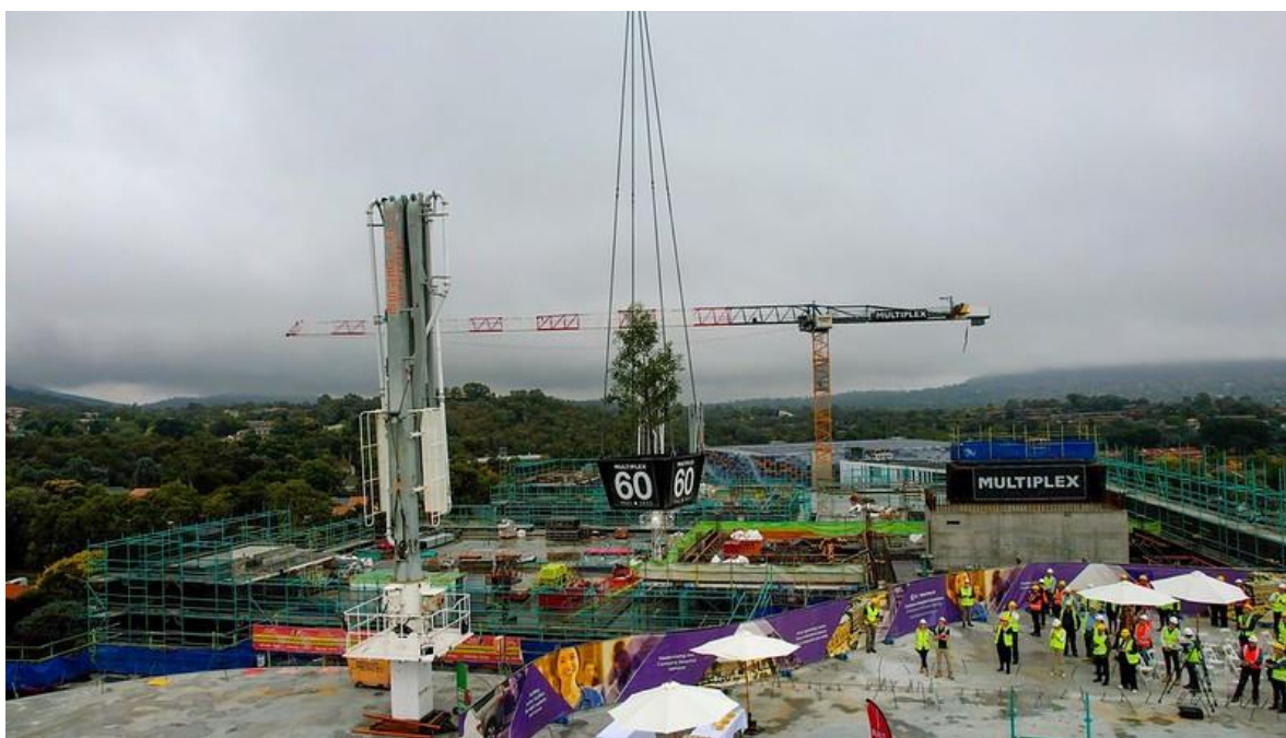
Canberra Hospital expansion