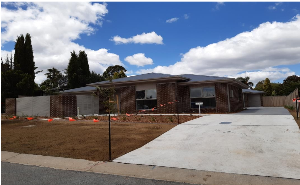
Completed new public housing property in the Inner South

There are currently 784 dwellings in the work in progress (WIP) schedule which includes 105 dwellings delivered YTD, 393 dwellings in the construction phase and 286 dwellings in planning and design. Eighteen dwellings and 11 land sites have also been purchased YTD and 111 tenants have relocated so far this financial year.