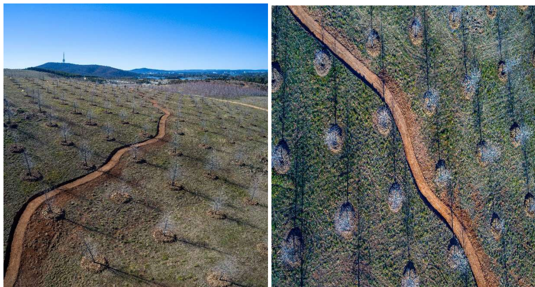
Tracks and trails at the National Arboretum