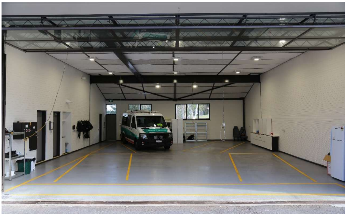
Non-Emergency Patient Transport Facility