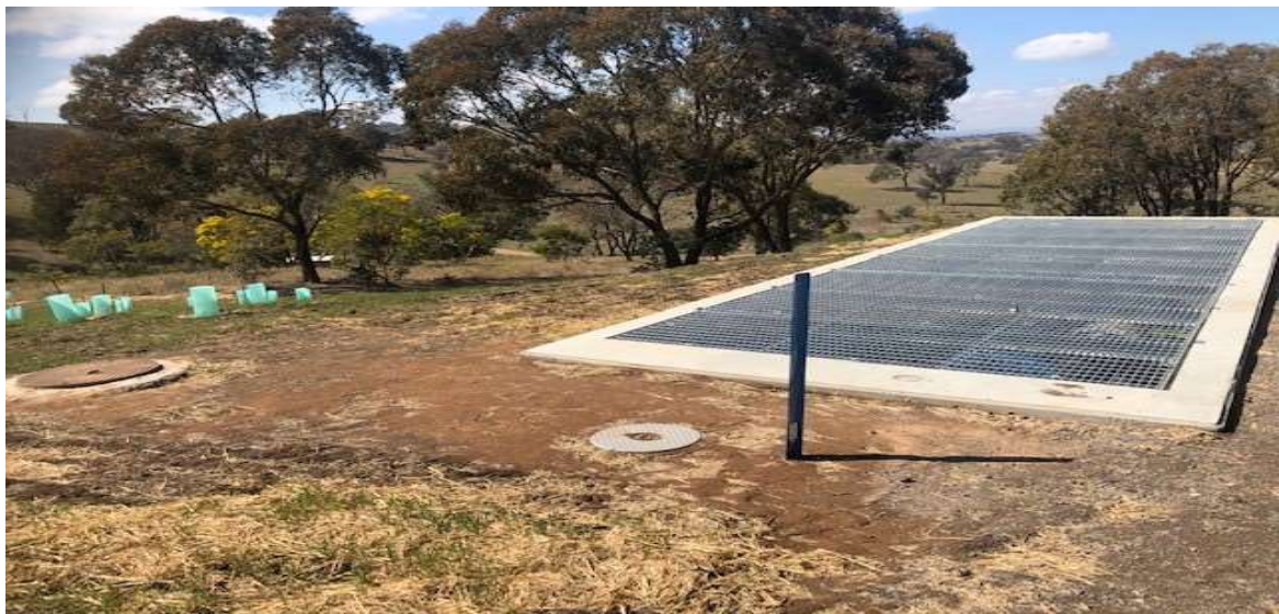
John Gorton Drive - Watermain from Weetangera Reservoir