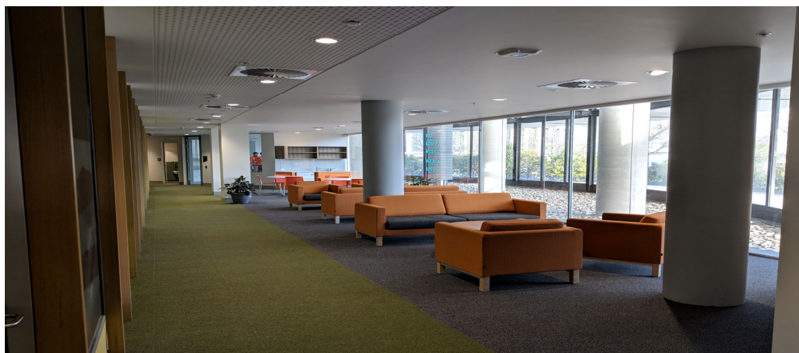
ACT Law Courts Facilities Remote Suites