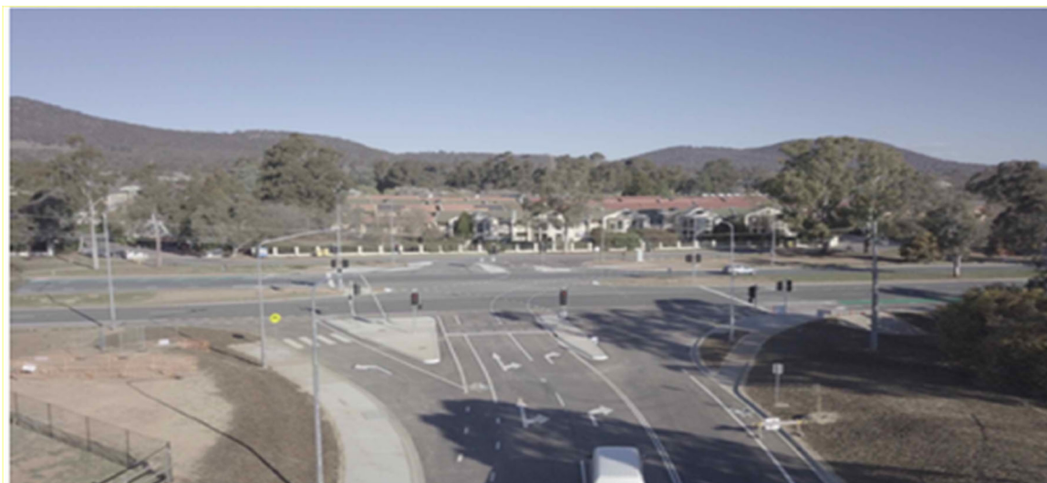
Old Well Station road – Federal Highway