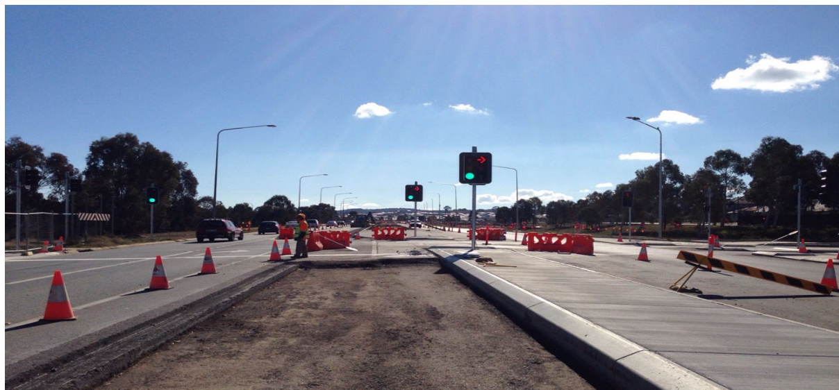
Horse Park Drive