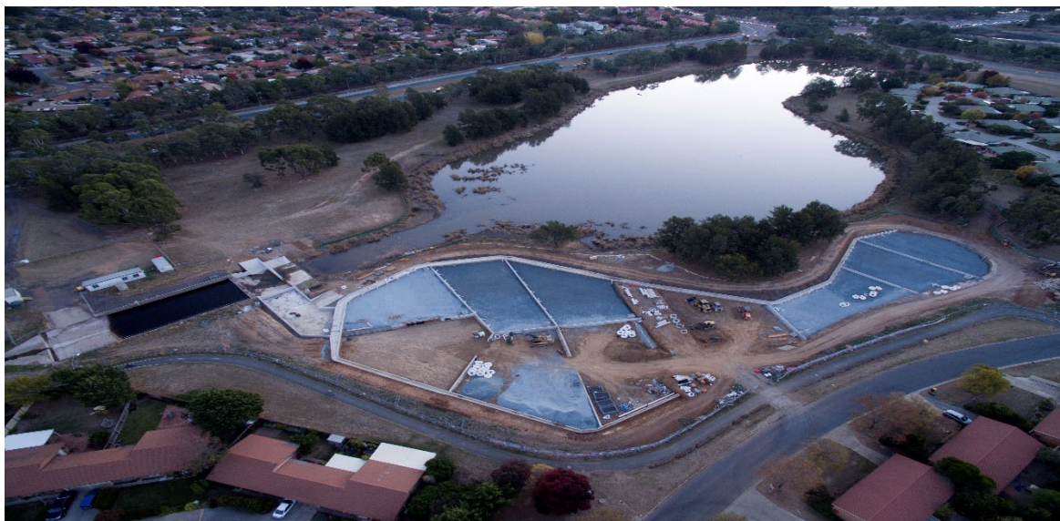
ACT Healthy Waterways