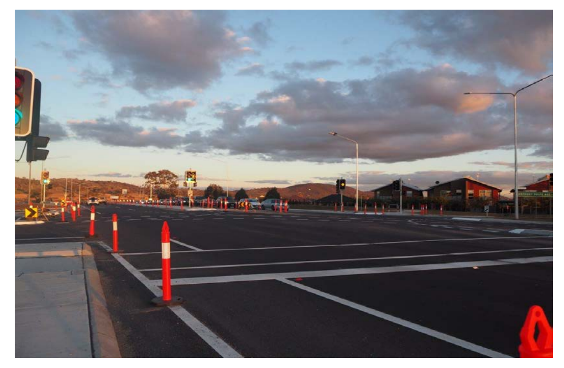
Horse Park Drive –Stage 1 Upgrades