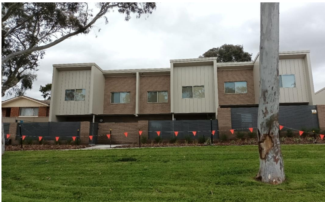
Public Housing Renewal