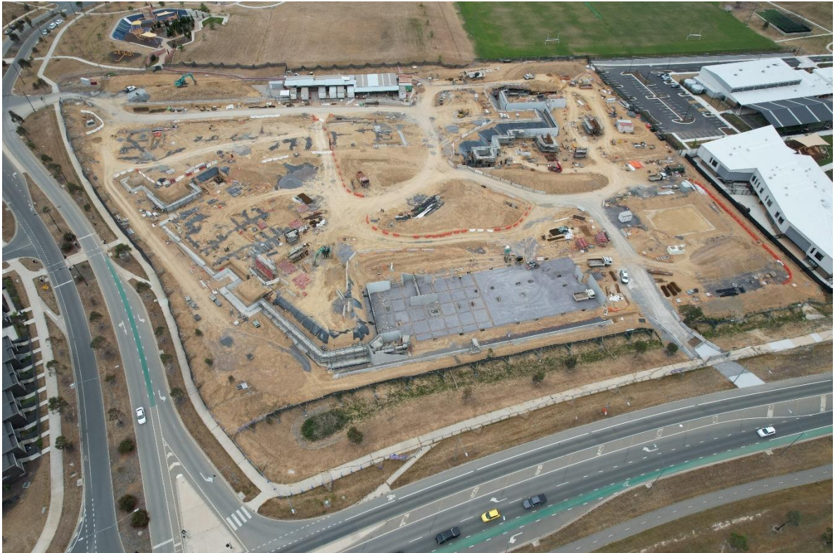
North Gungahlin High School

The Capital Works Program also includes investment in Information and Communication Technology (ICT) and Plant and Equipment (P&E).