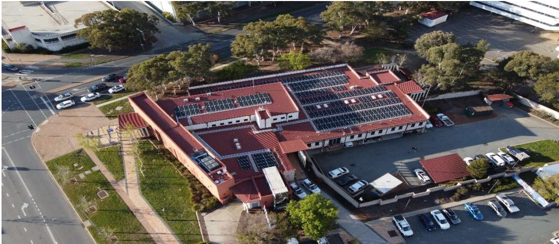
Solar installation and temporary chiller at Tuggeranong Police Station and new lifts at the Winchester Police Centre