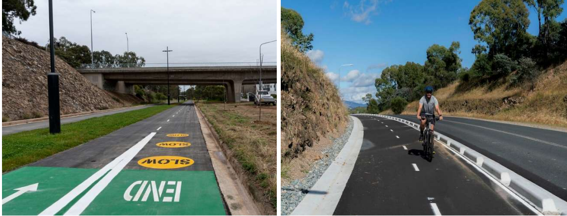
Belconnen bike way and Heysen Street Bike-Path