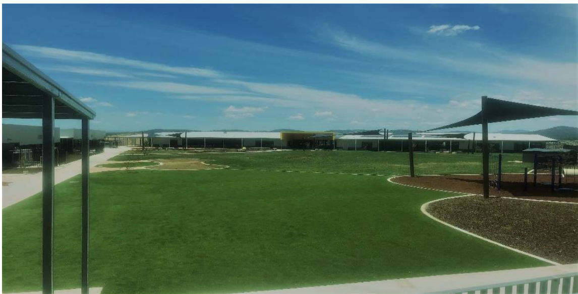
Evelyn Scott School (Project: Delivering Molonglo P-10)