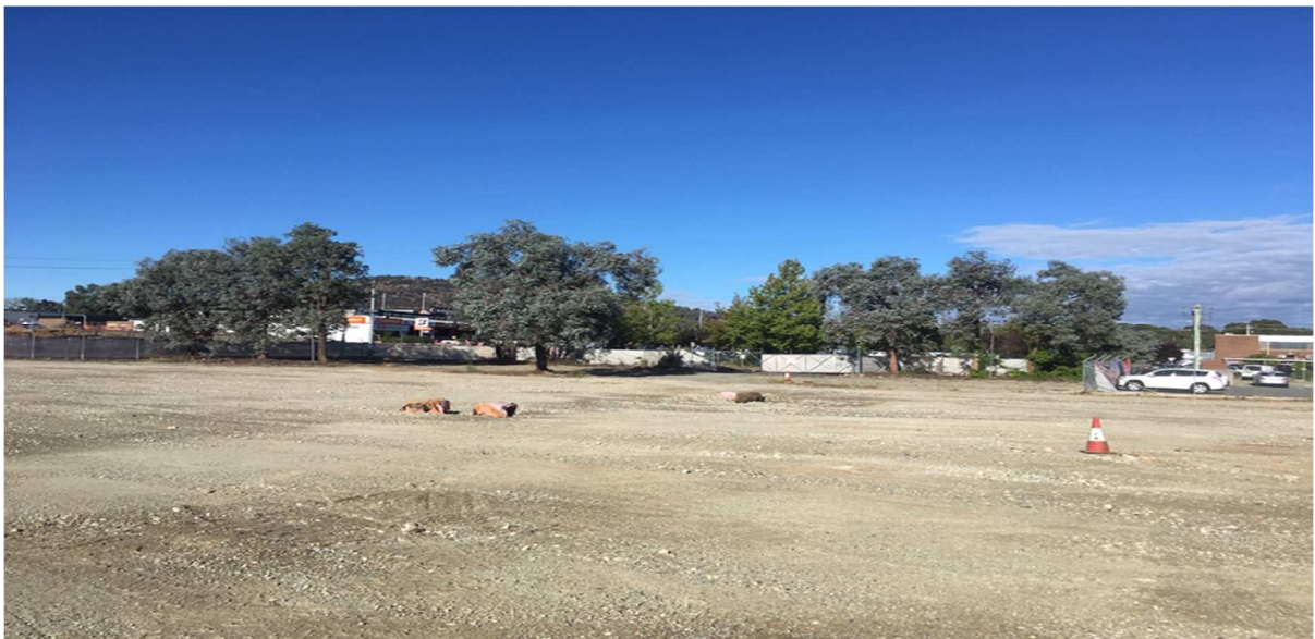
Woden Bus Depot Site