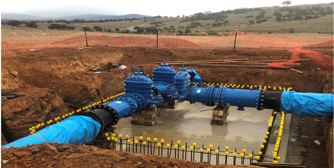
John Gorton Drive 3A Watermain pit