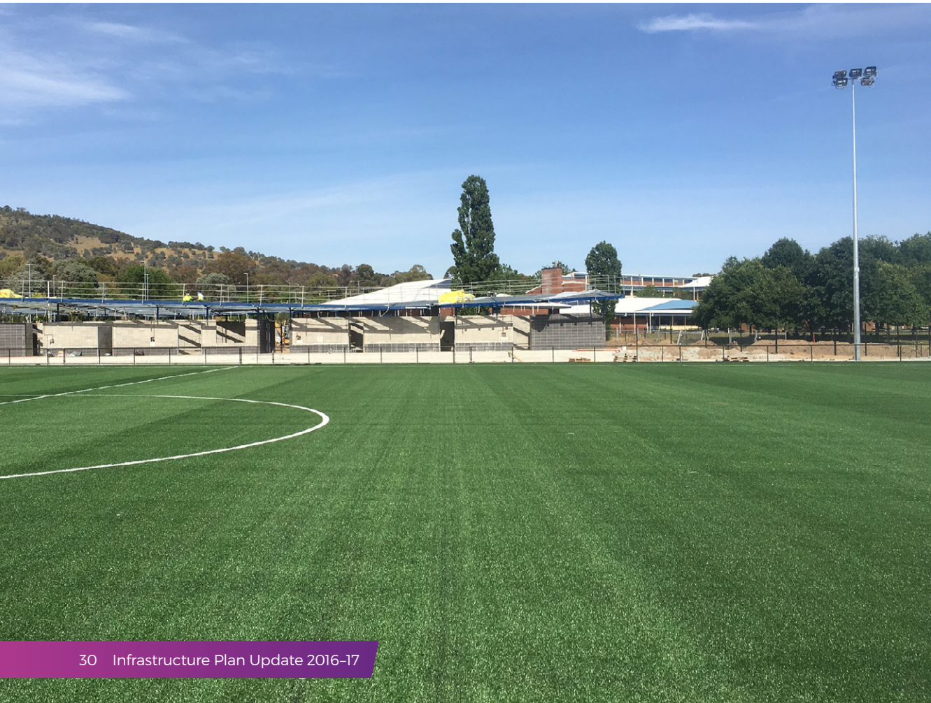
Melrose High School Football Precinct

Works are also continuing on the construction of a sports facility at Melrose High School and Philip Oval with total funding of $10.7 million. When completed, the Melrose High facilities will include a new FIFA accredited synthetic football field and multi-use hard courts. The upgrade of Philip Oval is being undertaken in conjunction with AFL NSW/ACT and Cricket ACT, and will enhance the capacity of the oval to serve as a second tier facility for AFL and cricket.