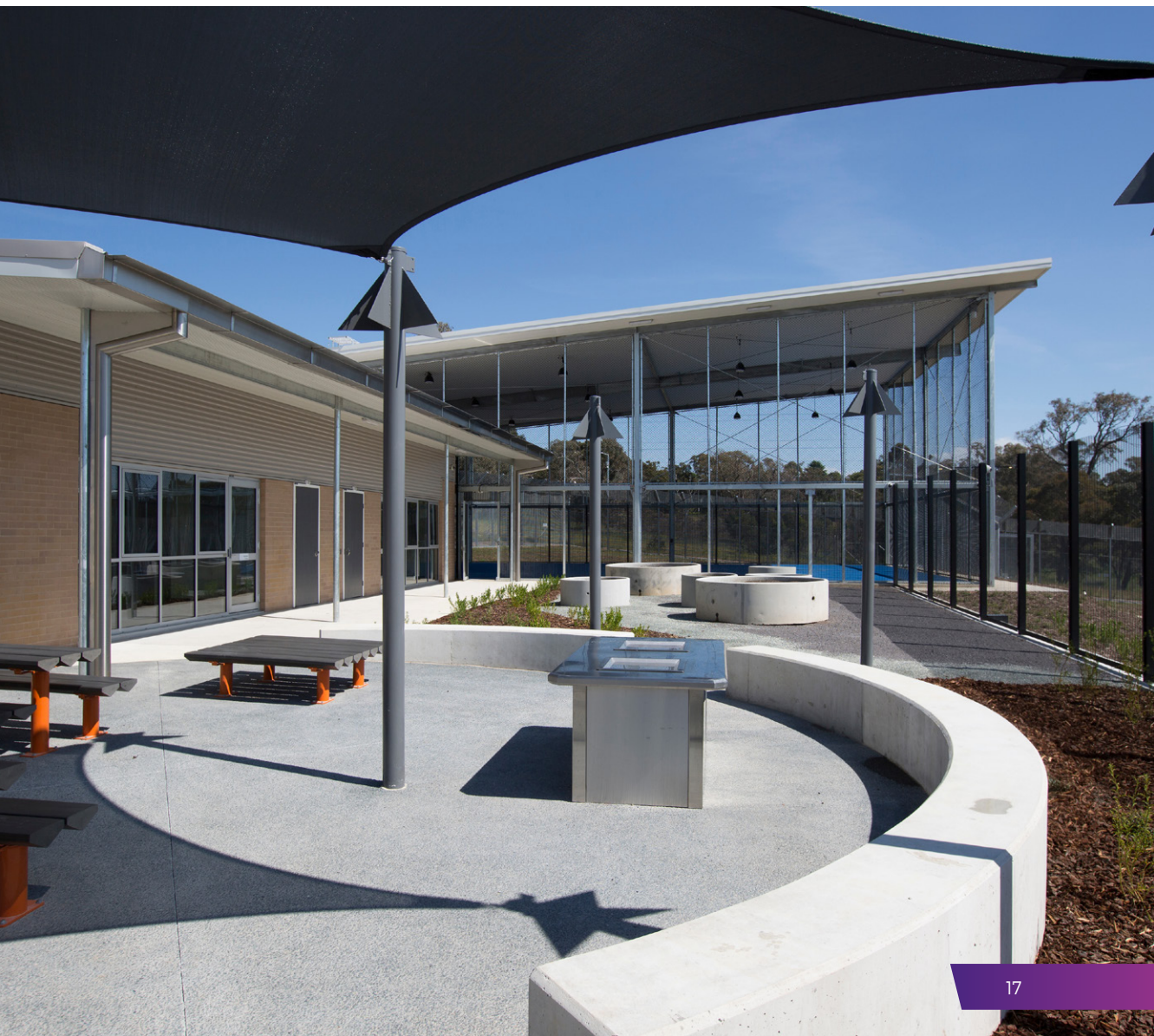
Dhulwa Mental Health Facility - Symonston

The recently opened $43.5 million Dhulwa Mental Health Unit provides 24 hour treatment for people with a moderate to severe mental illness. The unit has 10 acute care beds and 15 rehabilitation beds for patients in a secure environment, who cannot be safely cared for in less restrictive settings.