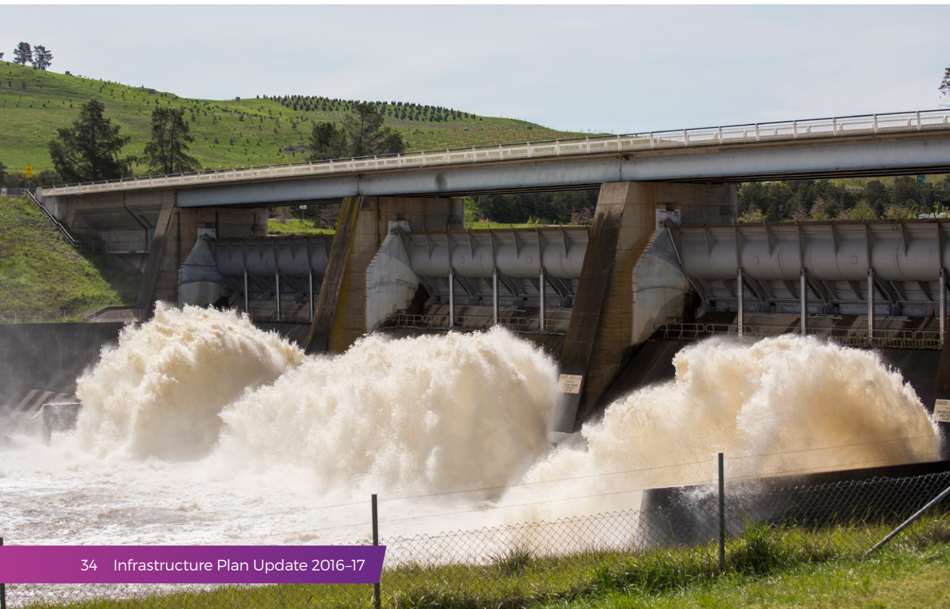
Scrivener Dam water flow management.

The Government will undertake vital environmental works to improve the longterm condition and sustainability of endangered species and habitat, by adding to the ACT conservation estate in Symonston and North Gungahlin. Establishing the Molonglo River Reserve – Stage 3 as part of the Molonglo Valley Plan will contribute to the Protection of Matters of National Environmental Significance. The reserve will protect native species and habitat, and will balance ecological conservation, bushfire mitigation and recreational activities.