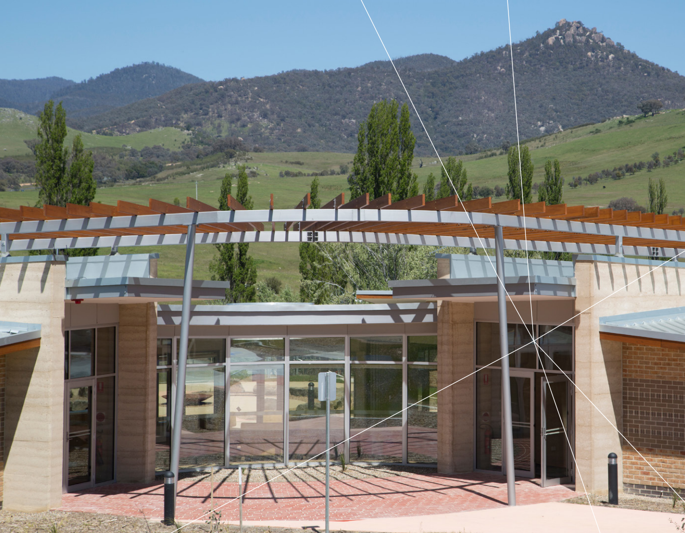
The Ngunnawal Bush Healing Farm, nearing completion, will provide a culturally appropriate alcohol and other drug residential rehabilitation service for adult Aboriginal and Torres Strait Islander people in the ACT