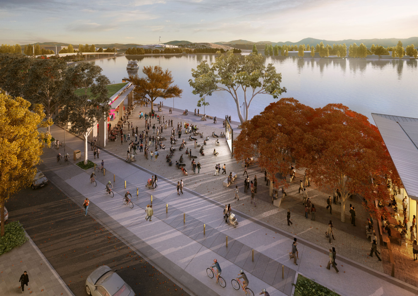
Artist's Impressions of City to the Lake – West Basin