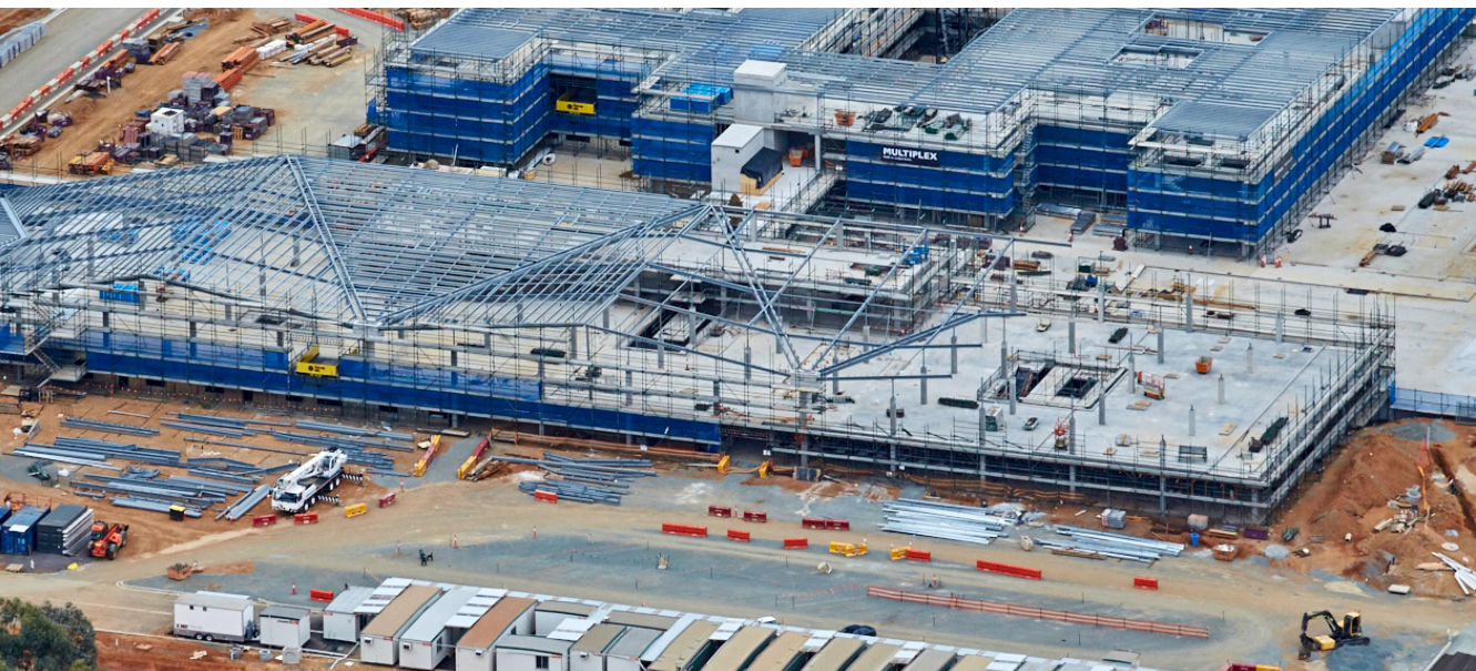
University of Canberra Public Hospital

The UCPH will also provide services for older people and people with mental health issues, as well as facilitating the implementation of the Rehabilitation and Aged Care Plan.