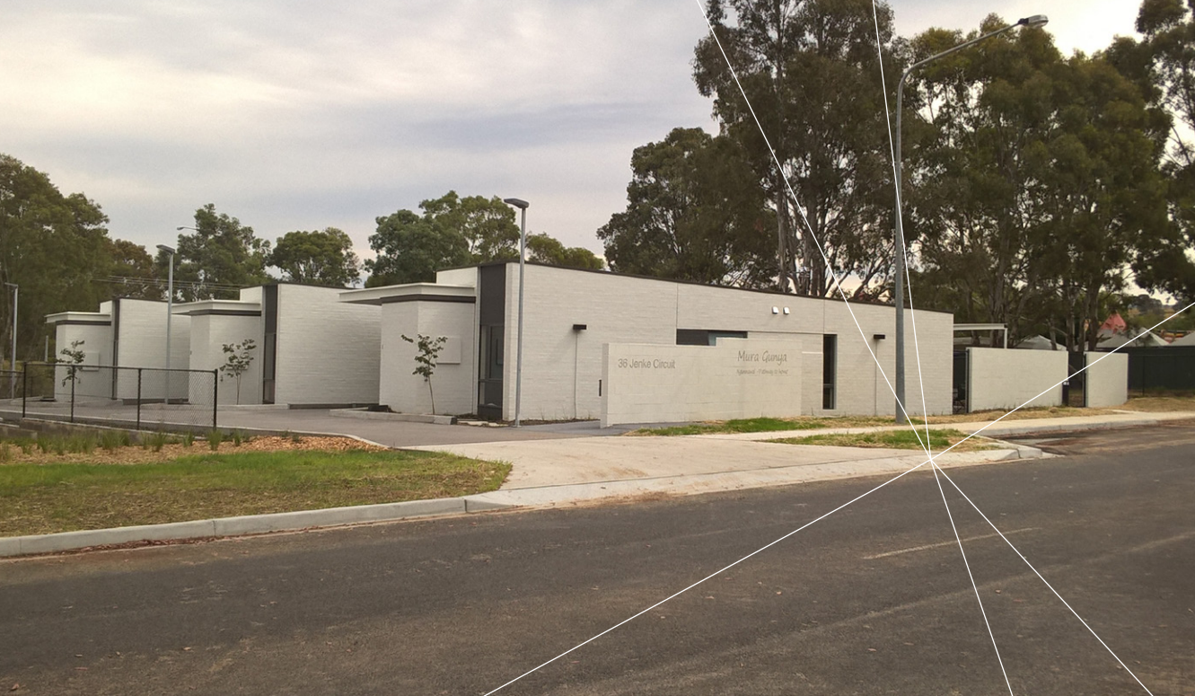
Mura Gunya, accommodation for older Aboriginal and Torres Strait Islander people – Kambah