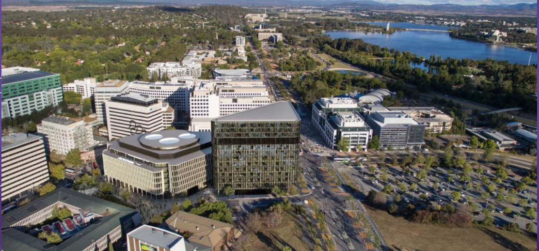
Artist's impression of the new hotel and government office building – Civic