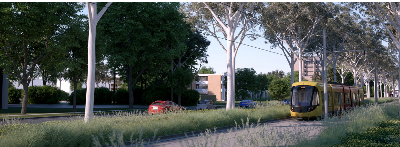
Artist's impression of Northbourne Avenue Light Rail – Stage 1 landscape

Transport Canberra will ensure that buses and Light Rail are integrated with each other, and with other forms of transport including taxis, walking and cycling. Innovative approaches to driving, parking and traffic management will also be encouraged in this integrated transport planning.