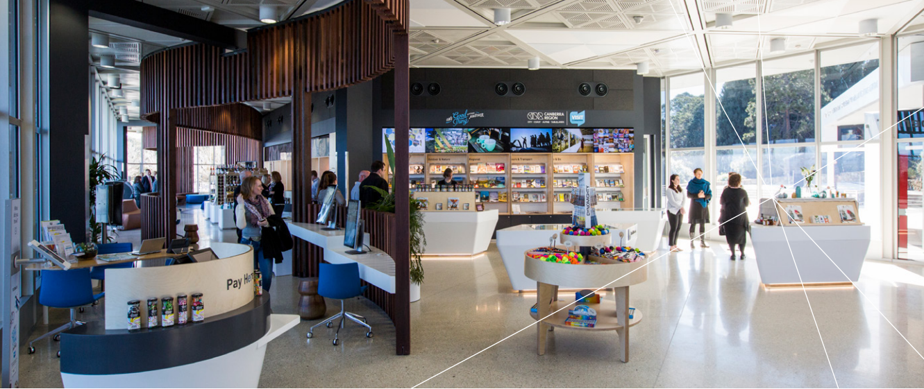
Opening of the Canberra Visitors Centre