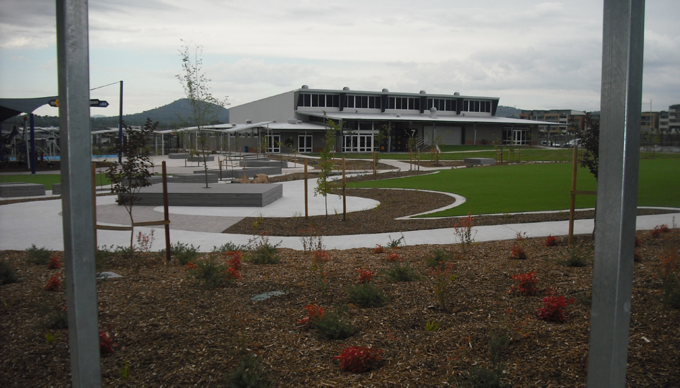
Charles Weston School - Coombs