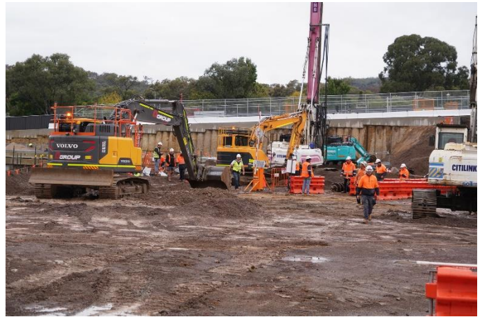
Canberra Hospital Expansion – Construction site images