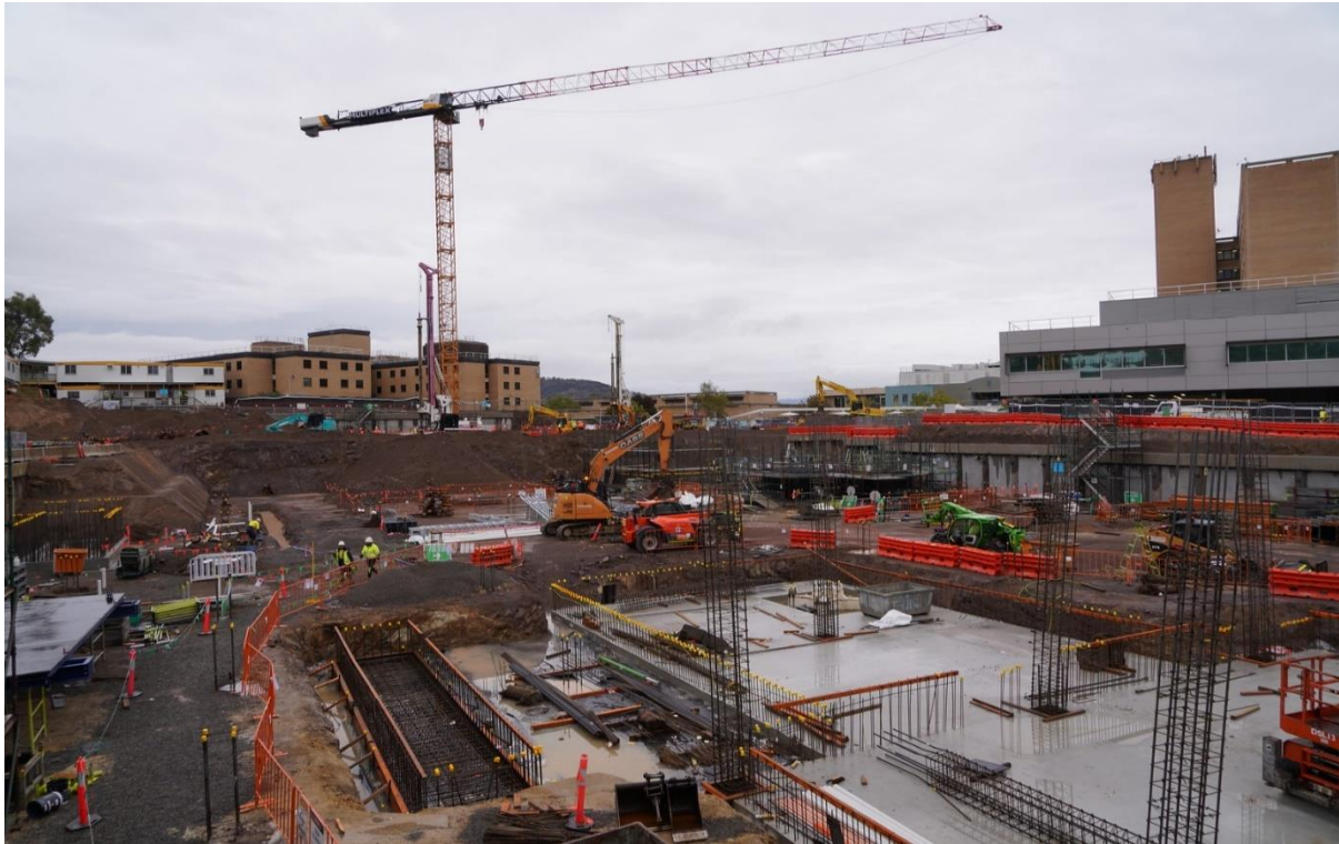
Canberra Hospital Expansion – Construction site images