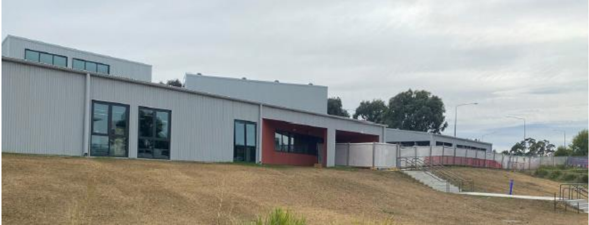
Amaroo school expansion