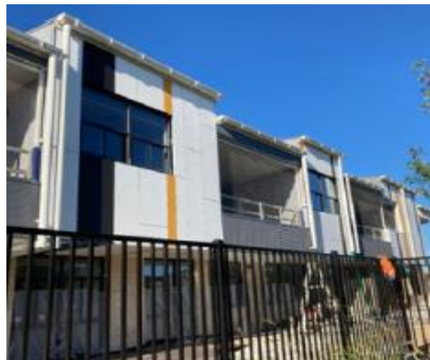
Franklin school expansion