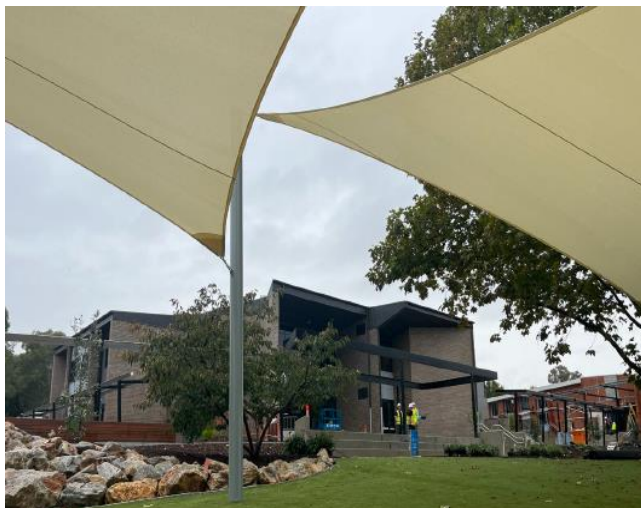
Campbell primary school modernization