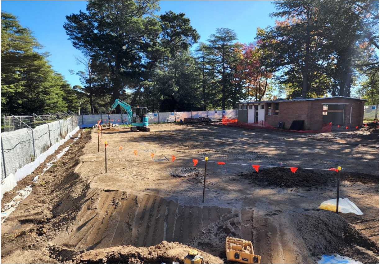
Haig Park Community centre