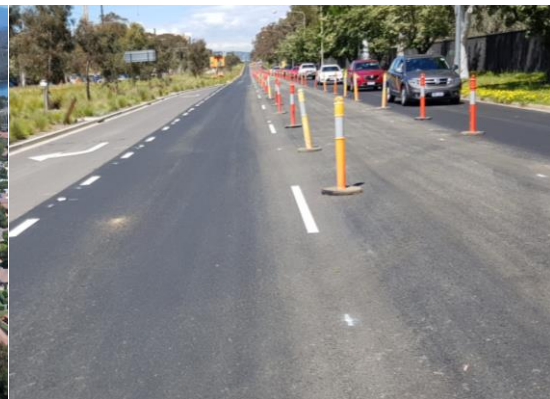
Northbourne Avenue Pavement Rehabilitation