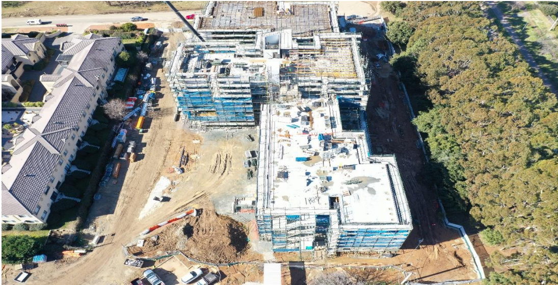
Common Ground Dickson