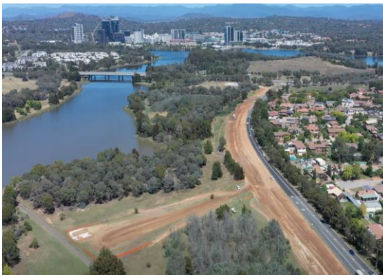
Gundaroo Drive Stage 3