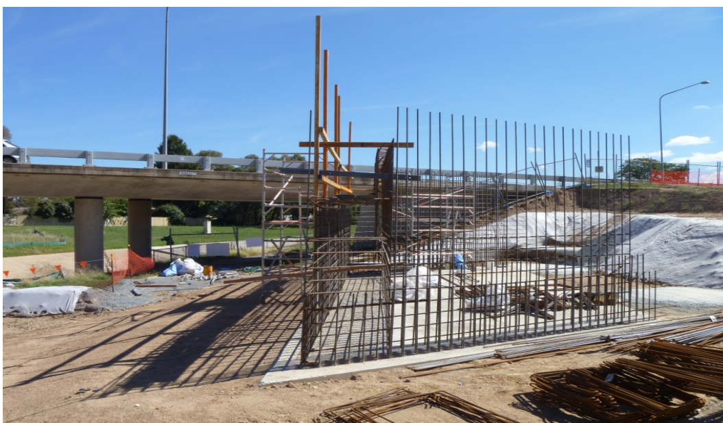
Ashley Drive - Stage 2 - Location: Monks Creek Bridge - Isabella Plains.