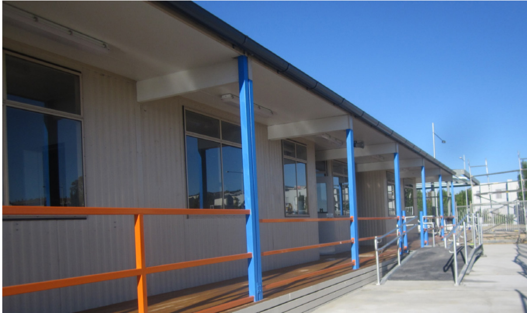
Neville Bonner School - Works to convert kindergarten rooms into preschool rooms and upgrade transportable classrooms from Gold Creek School to provide increased capacity.