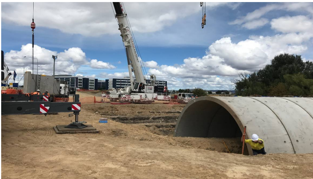
Bebo Arch Placement – Majura Link Road