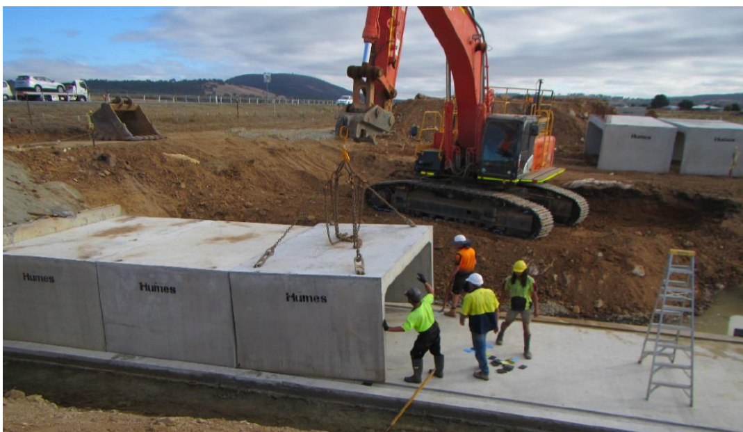
Majura Link Road - Reinforced Concrete Box Culvert Extension from Majura Parkway