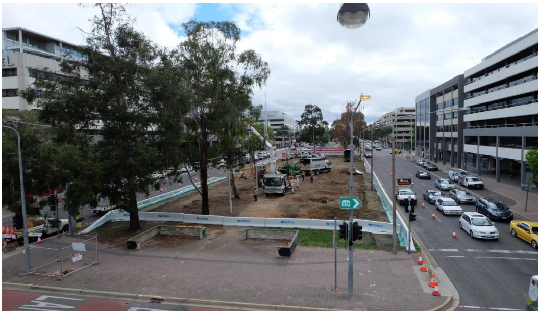
Light Rail - Stage 1 - Northbourne Avenue and Alinga Street intersection