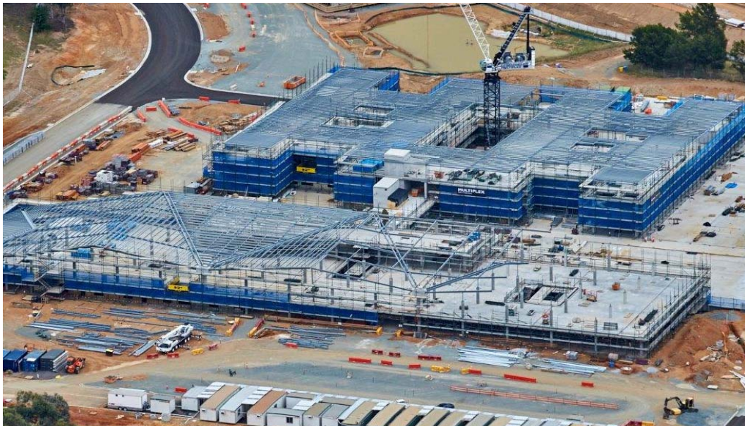
University of Canberra Public Hospital