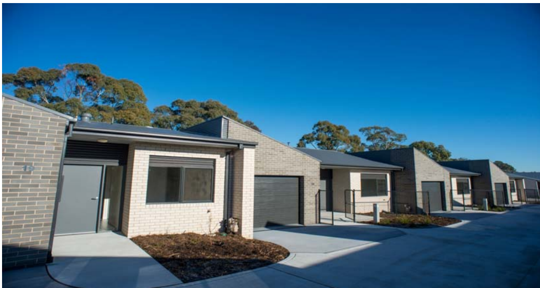
Chisholm Public Housing - part of the Public Housing Renewal Program

The new public housing will replace older multi-unit public housing estates on Northbourne Avenue and in other key locations across Canberra. These sites, once vacated, will be sold for redevelopment.