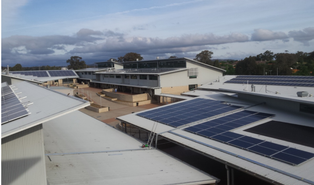
Solar panel installation - Amaroo School