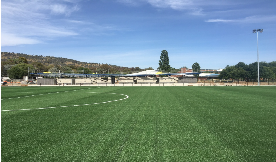
Melrose High School Football Precinct