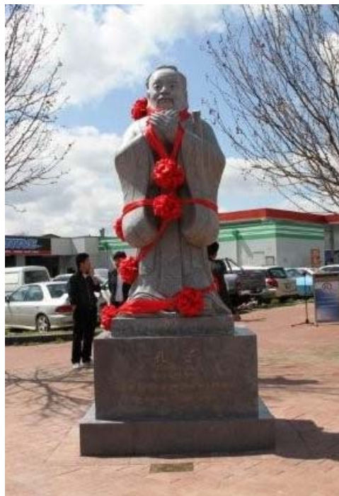
The Statue of Confucius in Dickson