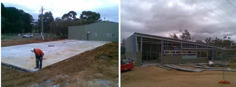
Works progressing on the Jerrabomberra (left) and Rivers (right) Sheds