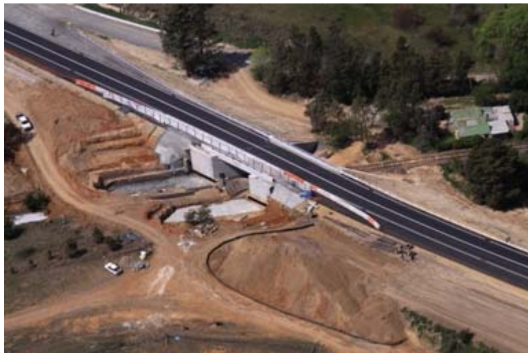
Lanyon Drive Upgrade - Looking south at the Westbound Carriageway Bridge