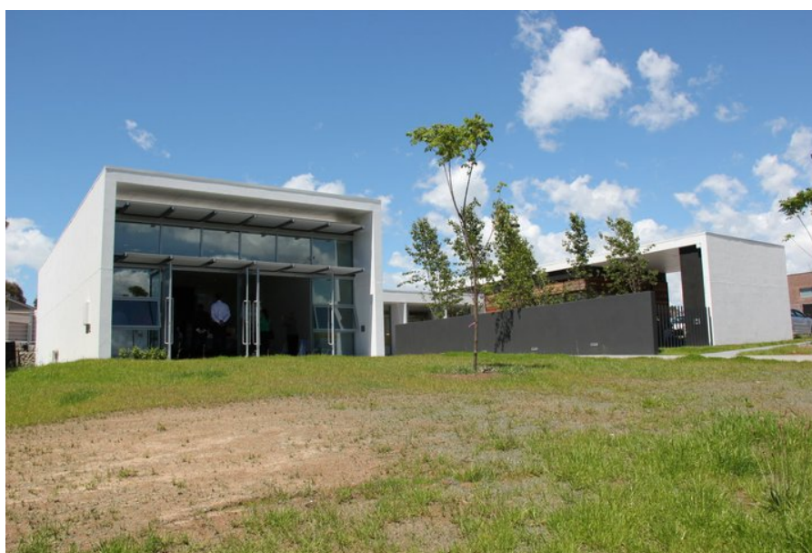
Bonython Neighbourhood Hall