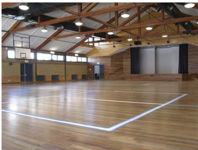
Extension of the multi purpose hall at Charles Conder Primary School