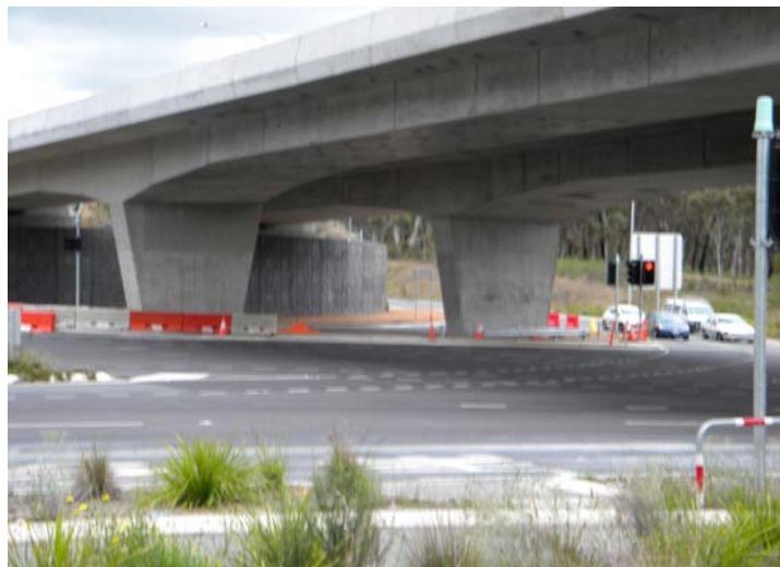
Duplication of the Belconnen Way overpass on the Gungahlin Drive Extension