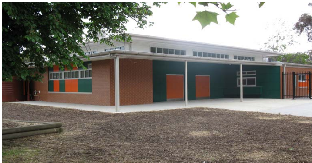
New multi purpose building and teaching spaces at Campbell Primary School

Works on other major education projects also include: