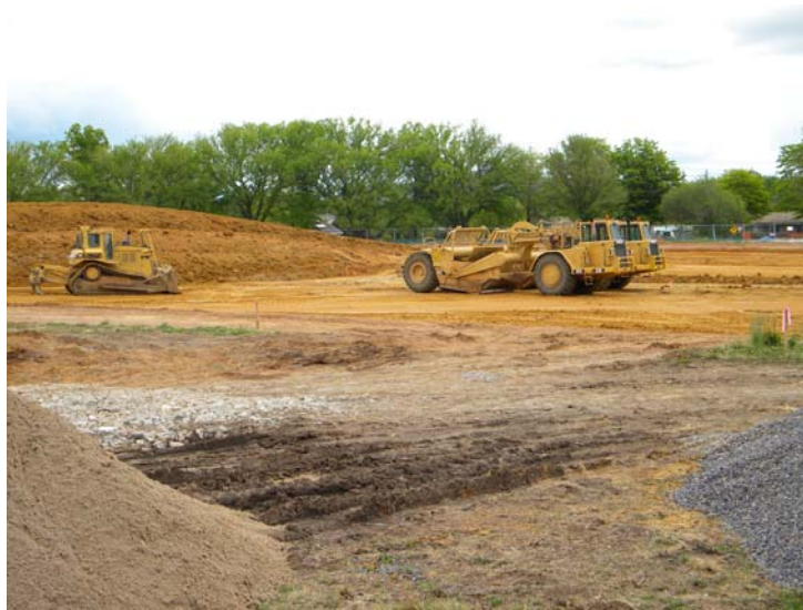
Works begin on the new wetlands in Dickson adjacent to Hawdon Street