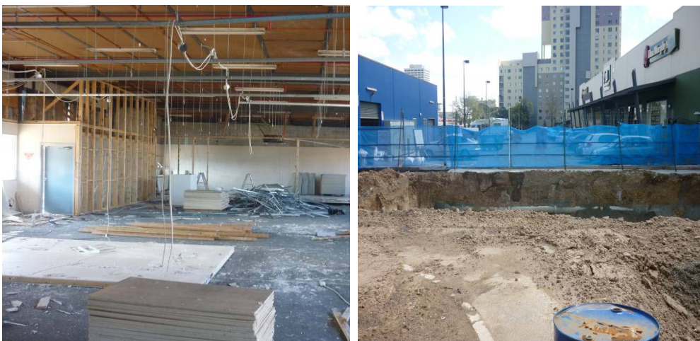
Re-use of existing building for construction of the New Forensic Medical Centre