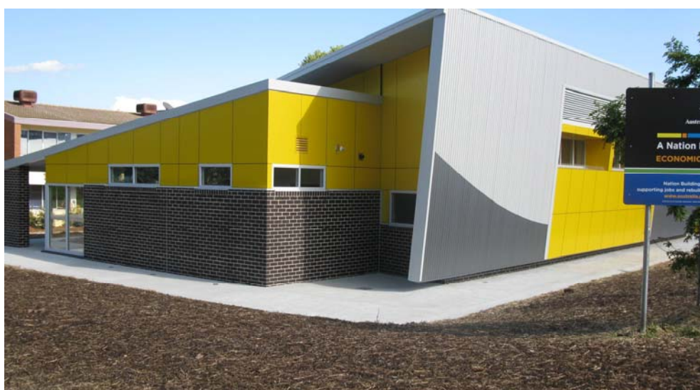
New multi purpose building including teaching spaces at Arawang Primary School