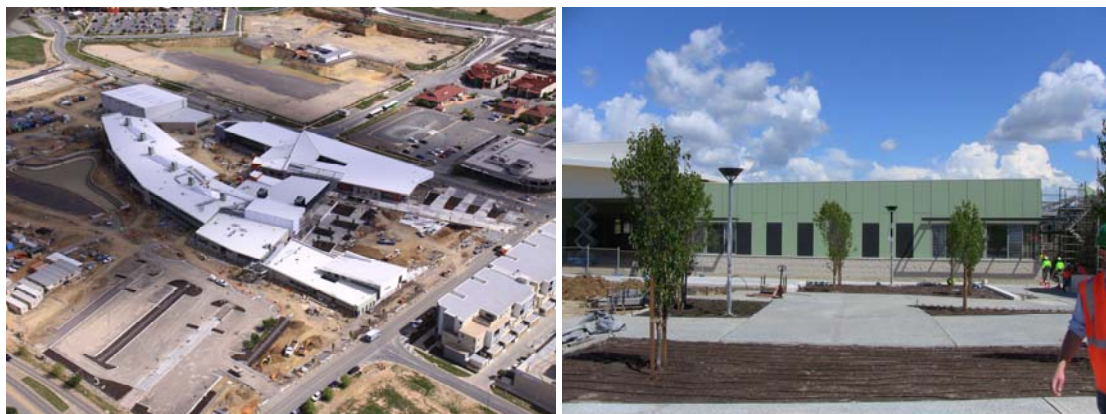
Gungahlin College and the Performing Art Centre enclosed in the precinct