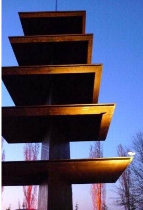
Toku at Canberra Nara Peace Park