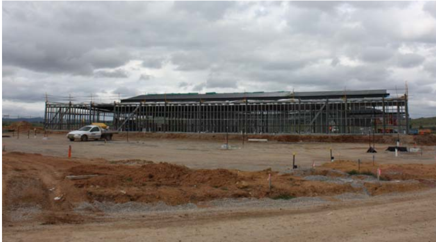
Construction underway at the Hume Training Centre