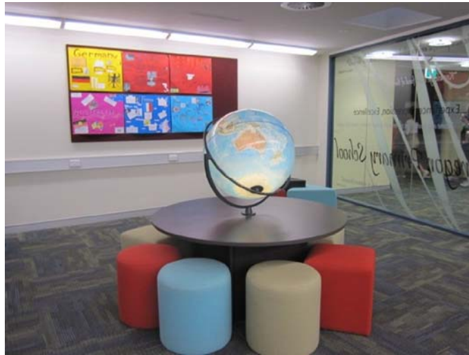
Extension and modification of the existing library at Macgregor Primary School