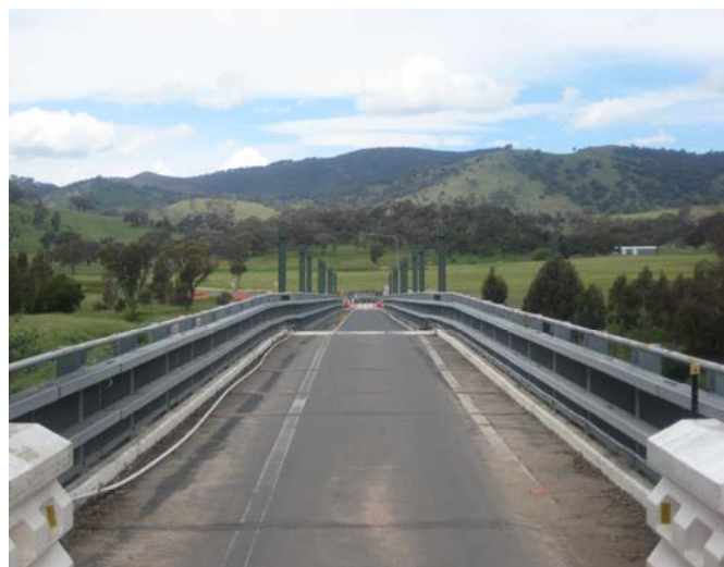
Trusses have been removed from the Tharwa Bridge for restoration