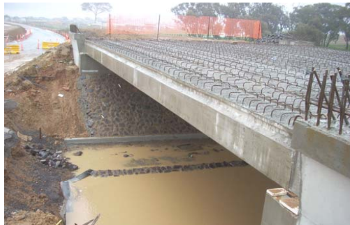
Progressing bridge work on Mulligans Flat Road