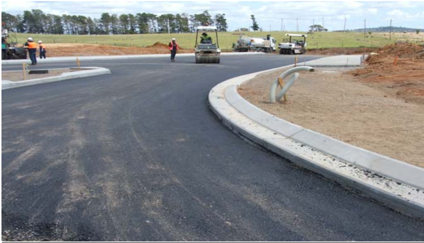
Completed bitumen at the Baldwin Drive/Maribyrnong Avenue intersection – Lawson