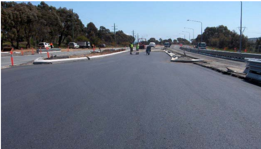
Ginninderra Drive/Allawoona Street – new turning lane at intersection – Lawson