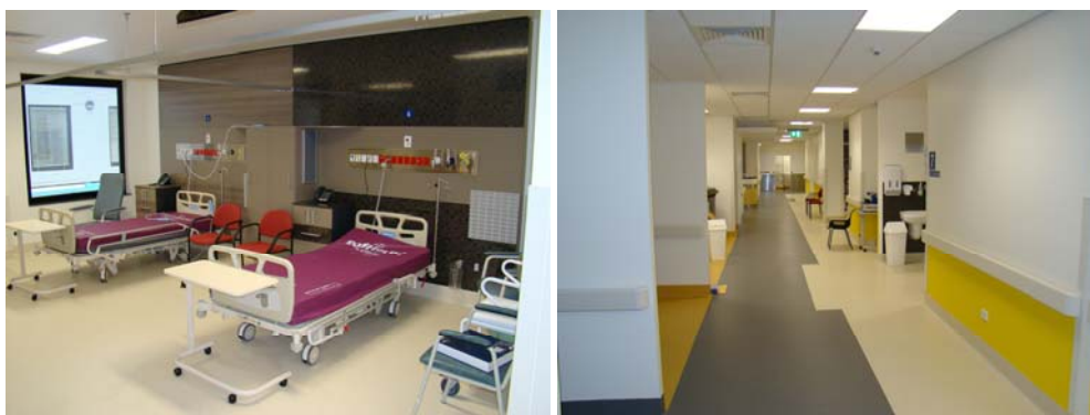
New facilities at the Surgical Assessment and Planning Unit (SAPU)

See also the Neurosurgery Operating Theatre Picture [Front Cover]