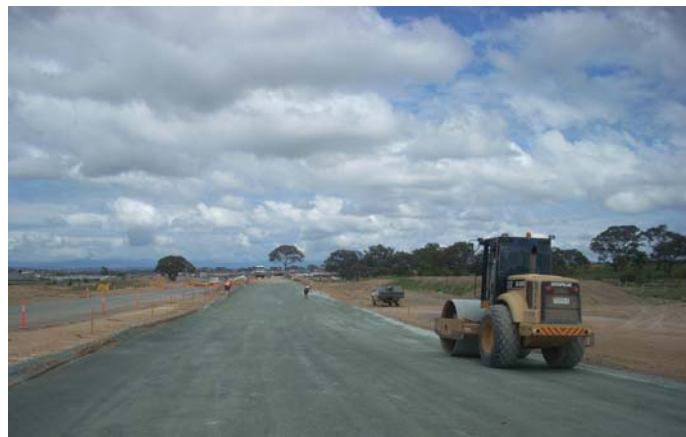
Road works progressing on Mulligans Flat Road