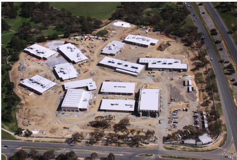
Structural completions at Kambah P-10 School