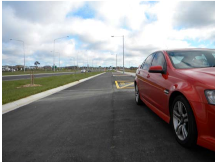
The completed Flemington Road Duplication