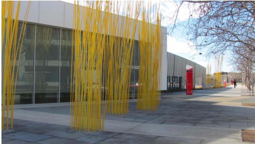
The new kinetic sculpture Dancers on a Lakefront at the Belconnen Arts Centre