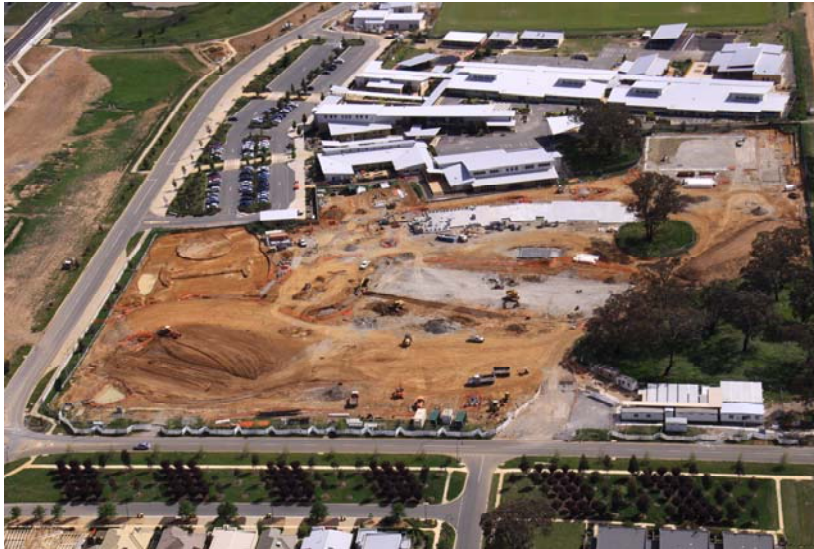
Site establishment and slab works underway at Harrison High School