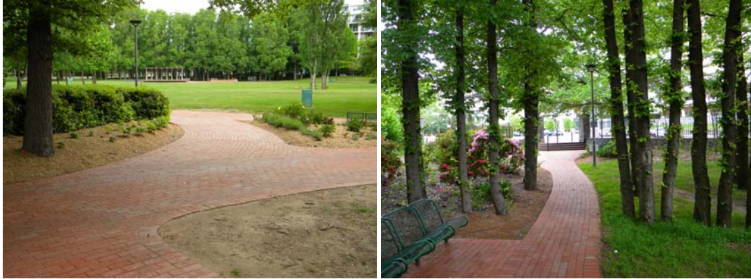
Completed pavement rehabilitation in Glebe Park