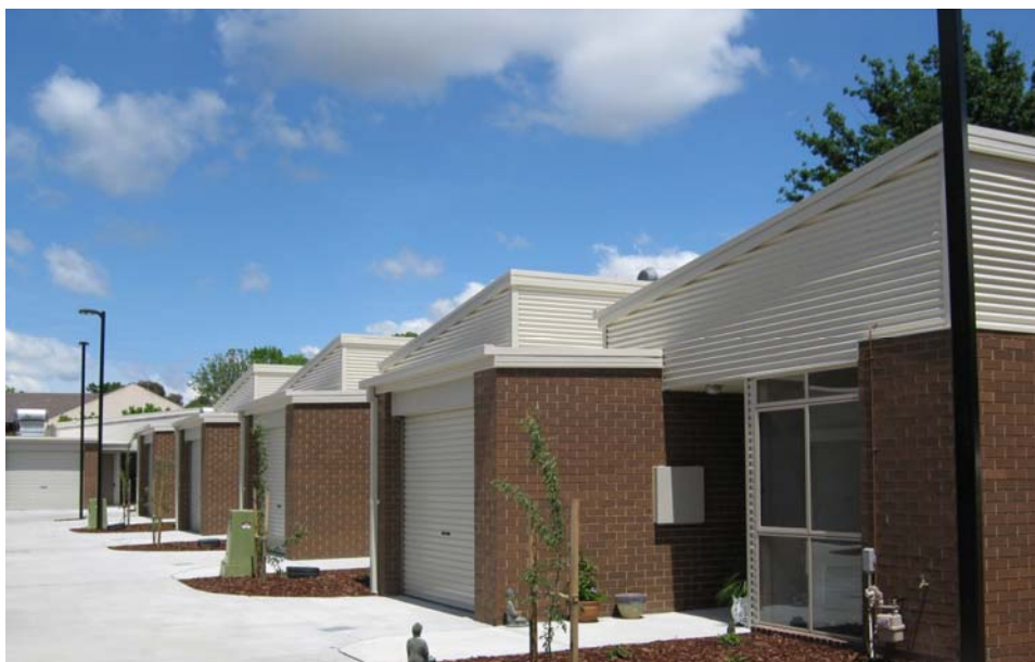
Completed social housing dwellings in Curtin ( Nation Building and Jobs Plan )