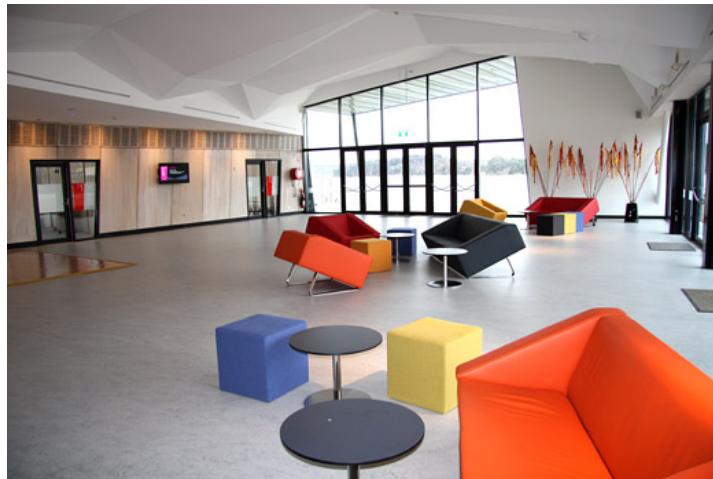
Figure 6 – The Arts Centre's Foyer