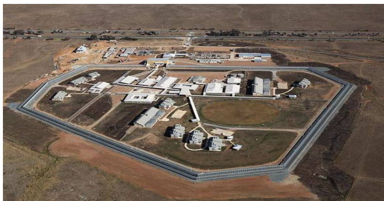
Figure 3 – Alexander Maconochie Centre