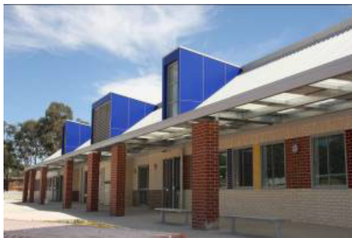
Figure 4 – Kingsford Smith School

school was completed in December 2008 and opened for students from Preschool to Year 7 in February 2009. The school will expand progressively each year to eventually cater for preschool to year 10 in 2012. A final package of minor works is being undertaken and will be completed by the end of the defects period in December 2009.