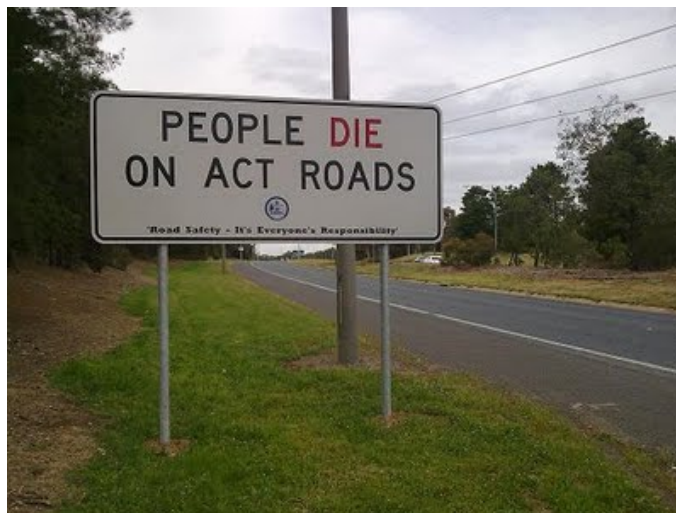
Figure 2 – A new road safety sign