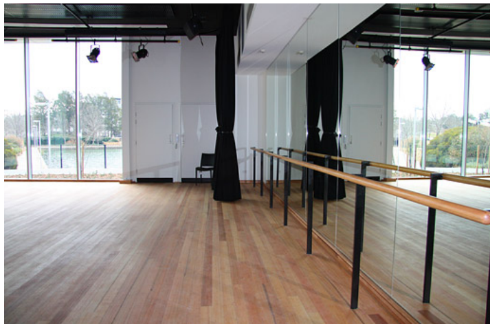
Figure 7 – The Arts Centre Dance Studio