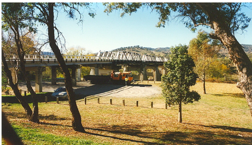
Figure 1 – Tharwa Bridge