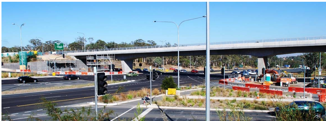
Figure 2 – Work on duplicating the GDE at the Belconnen Way Overpass.

A number of significant milestones achieved as at 31 December 2009 are included below.