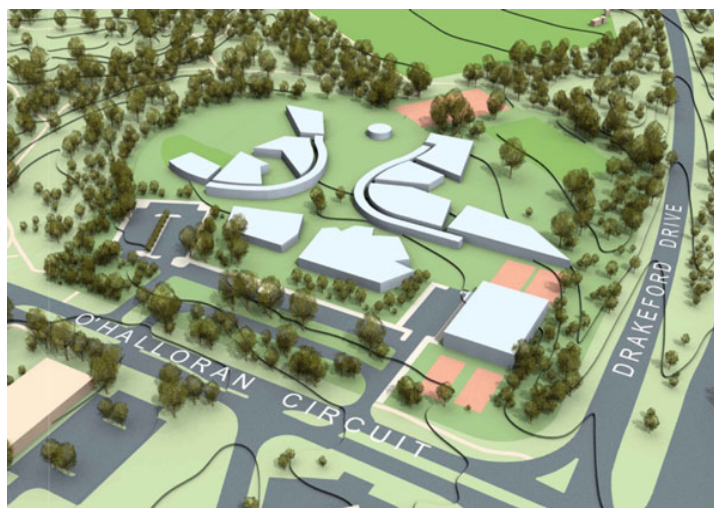
Figure 8 – Artist's impression of New Kambah P-10 School