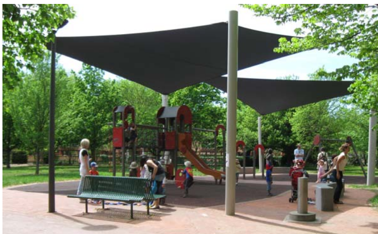
Figure 12 – Glebe Park Shading for Play Area