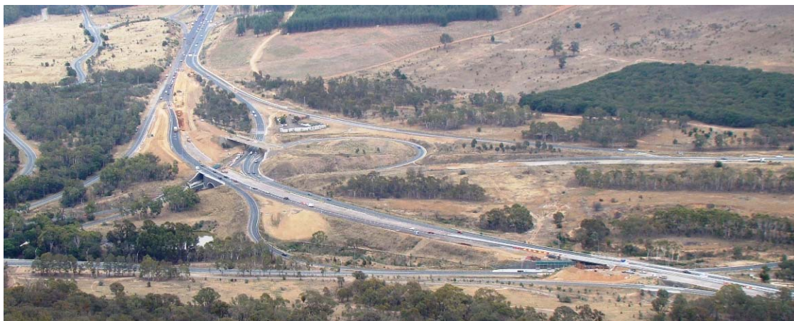
Figure 3 – View of current work on duplicating the GDE at the Glenloch Interchange