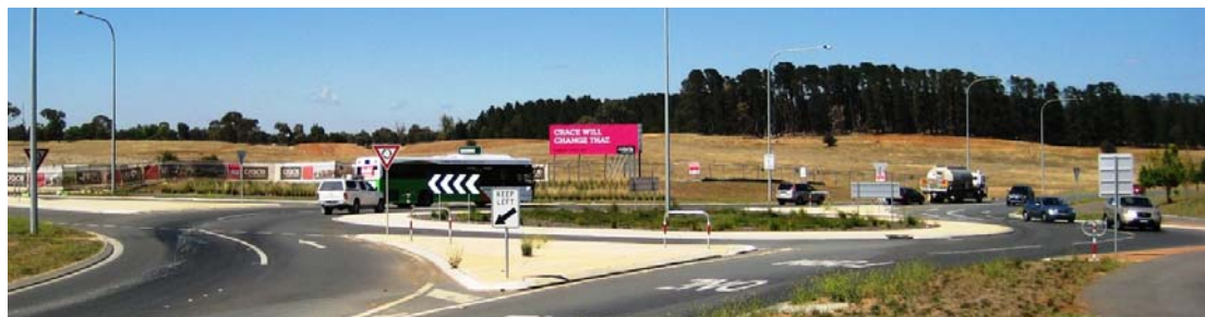
Figure 6 – Crace Road Infrastructure