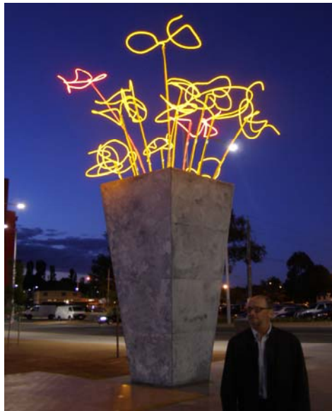
Figure 16– Vessel of Horti(cultural) Plenty