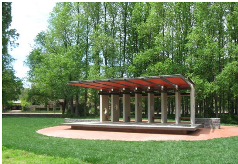
Figure 11 – Glebe Park Stage