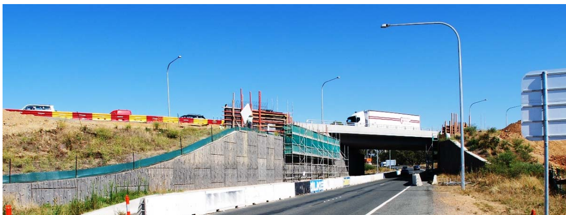
Figure 4 – Construction underway at an overpass at Glenloch Interchange