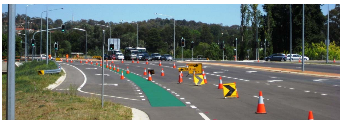
Figure 7 – A section of upgraded Airport Roads