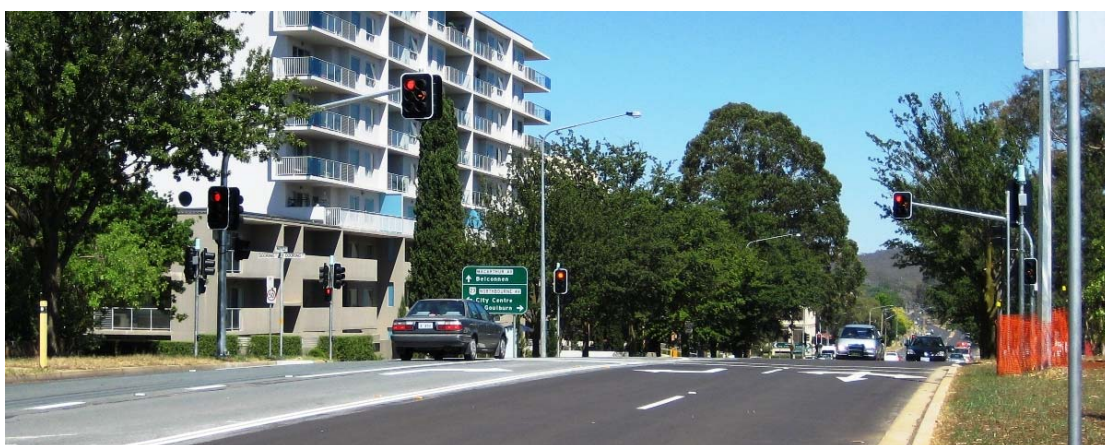
Figure 5 – New Traffic Lights at Wakefield Avenue Intersection