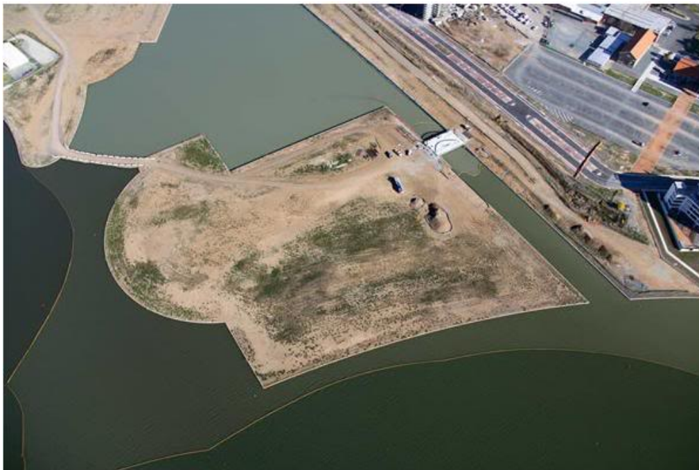
Figure 1 – The Kingston Foreshore, including ‘The Island’.