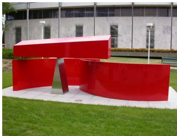
Figure 17 – Gravity Circle