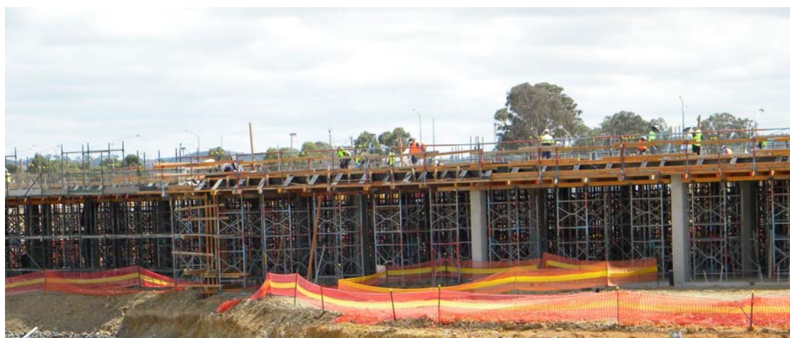
Figure 9 – Construction work on the Gungahlin College