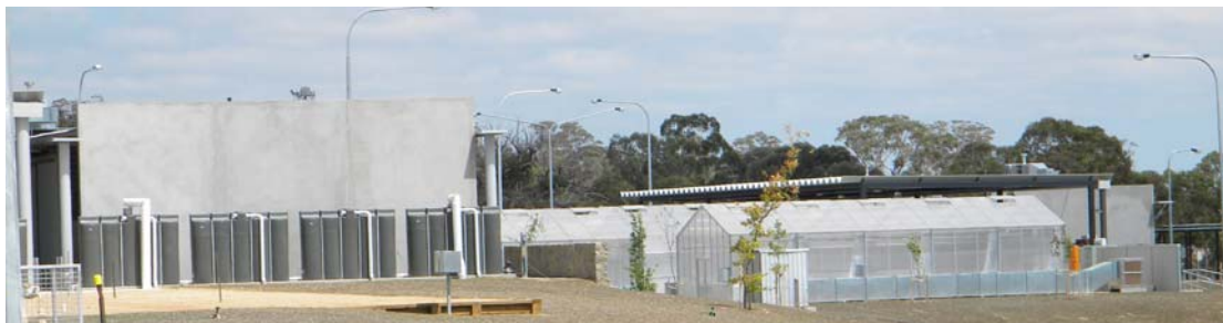
Figure 10 – The newly constructed Horticultural Facility at CIT Bruce