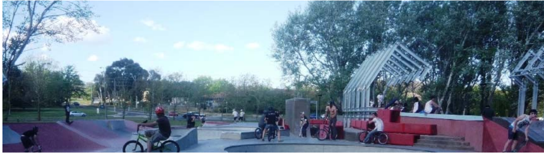
Figure 13 – Eddison Park Youth Recreation Facility